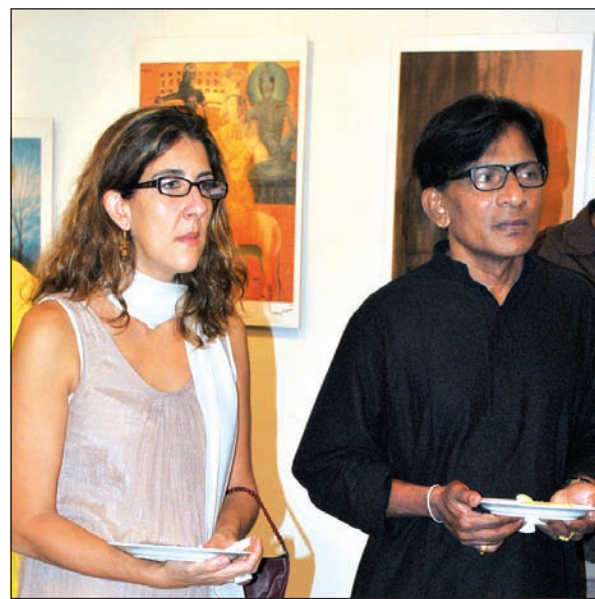
Guests at the event