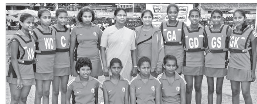
Holy Family Convent, Kurunegala who also win the under 14 championship with team officials.