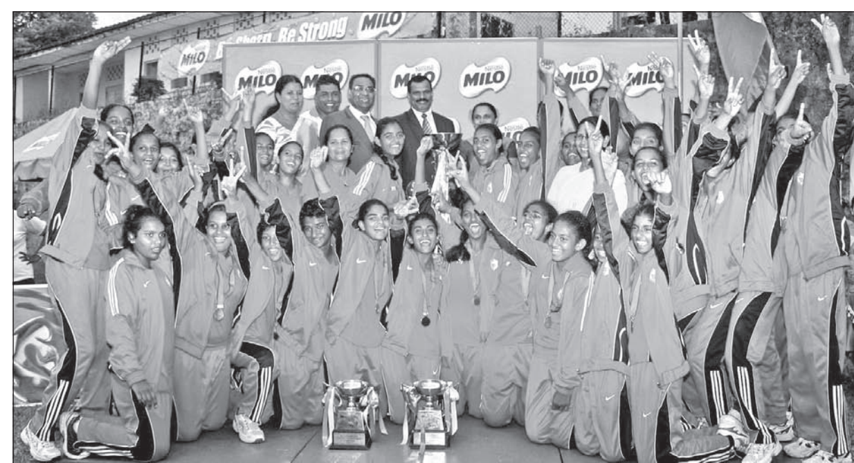
The Champion Holy Family Team with their respective trophies.