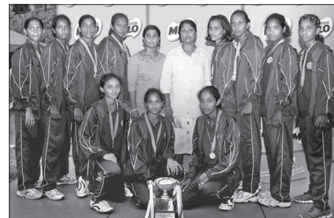
Under 18 champions Kalutara Balika Vidyalaya team