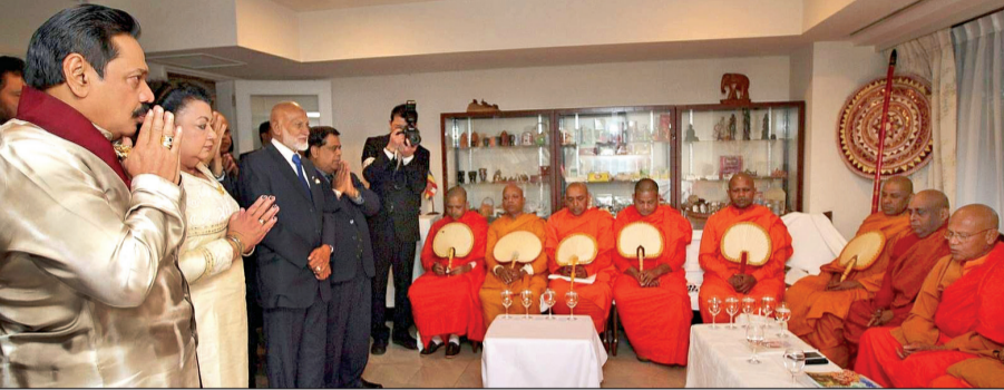
President Mahinda Rajapaksa and First Lady Shiranthi Rajapaksa participating in religious observances at the Sri Lankan Embassy in Tokyo.