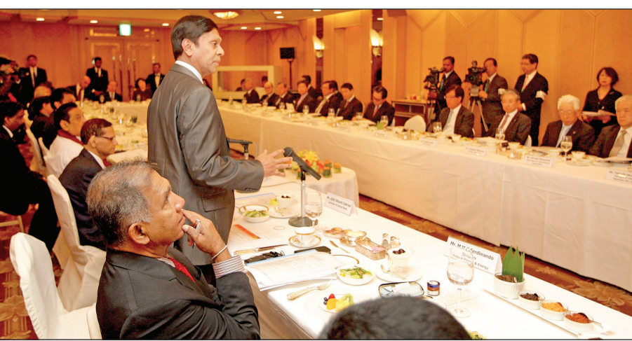
Central Bank Governor Ajith Nivard Cabraal addressing the audience about the economic climate prevailing in the country as well as areas of opportunities for potential investors.