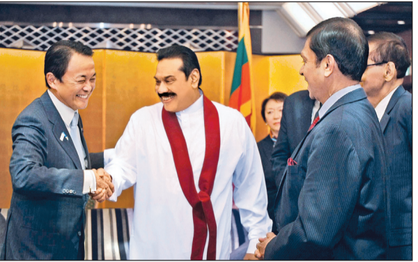
Deputy Prime Minister of Japan Taro Aso paying a courtesy call on President Mahinda Rajapaksa.