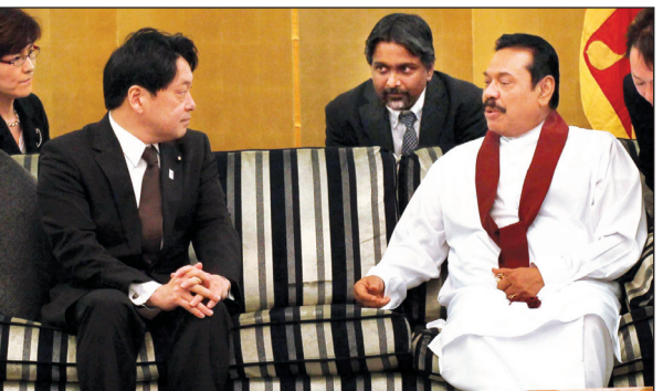
President Mahinda Rajapaksa meeting Japanese Defence Minister Mr. Itsunori