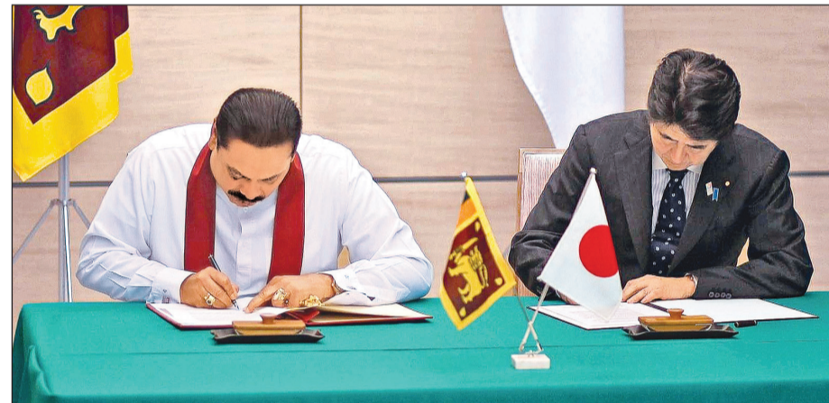
President Mahinda Rajapaksa and Prime Minister of Japan Shinzo Abe sign the joint statement that would among other aspects, expand maritime cooperation between the two countries.