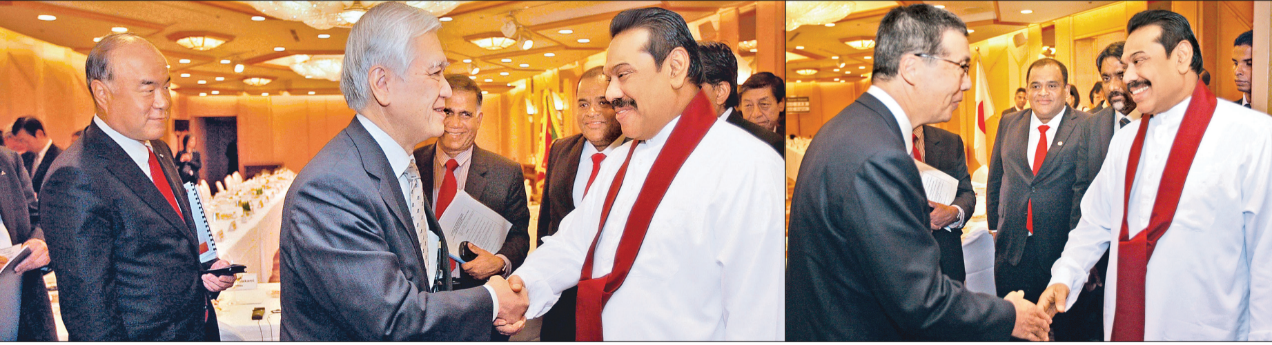
President Mahinda Rajapaksa meeting leaders of Japan's corporate and industrial sectors.