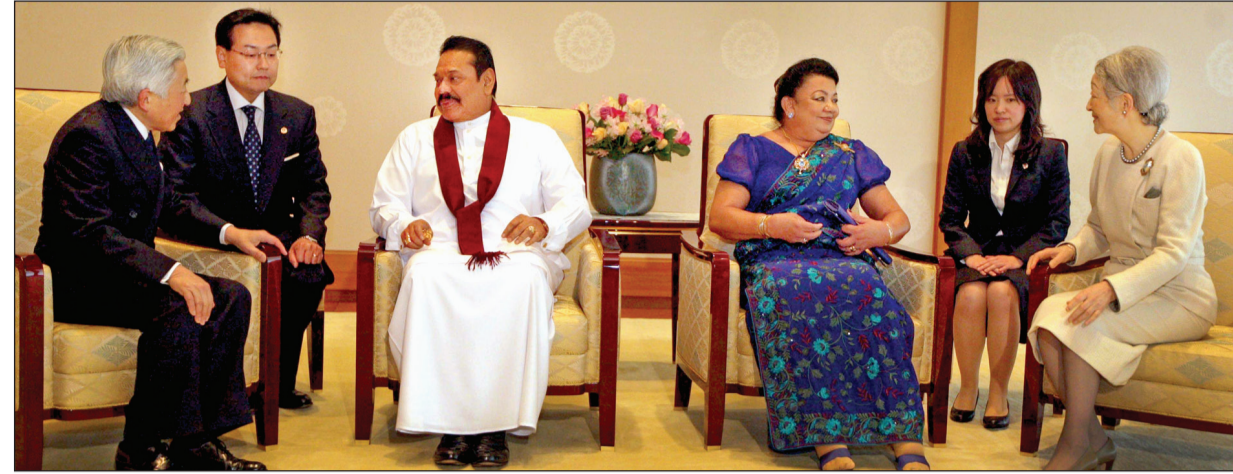
President Mahinda Rajapaksa and First Lady Shiranthi Rajapaksa having an audience with Emperor Akihito and Princess Michiko at the Imperial Palace. The Japanese Emperor hosted a lunch in honour of President Rajapaksa and the First Lady.