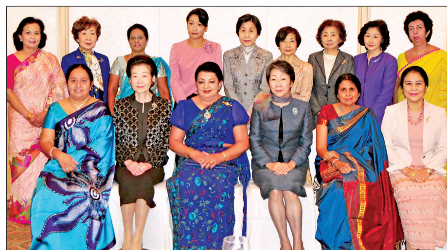
First Lady Shiranthi Rajapaksa with members of the Asia Pacific Ladies Friendship Society