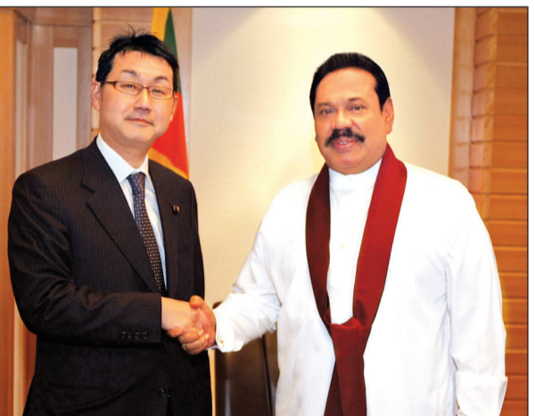
Japan's Member of the House of Representatives and Chairman of the Committee on Foreign Affairs Katsuyuki Kawai paying a courtesy call on President Mahinda Rajapaksa.