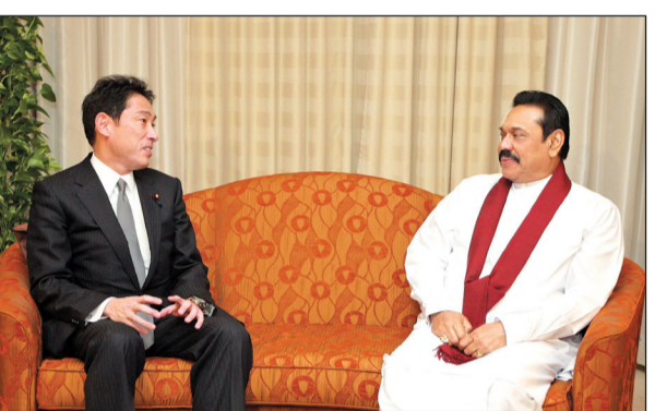
Japan's Foreign Affairs Minister Fumio Kishida having talks with President Mahinda Rajapaksa.