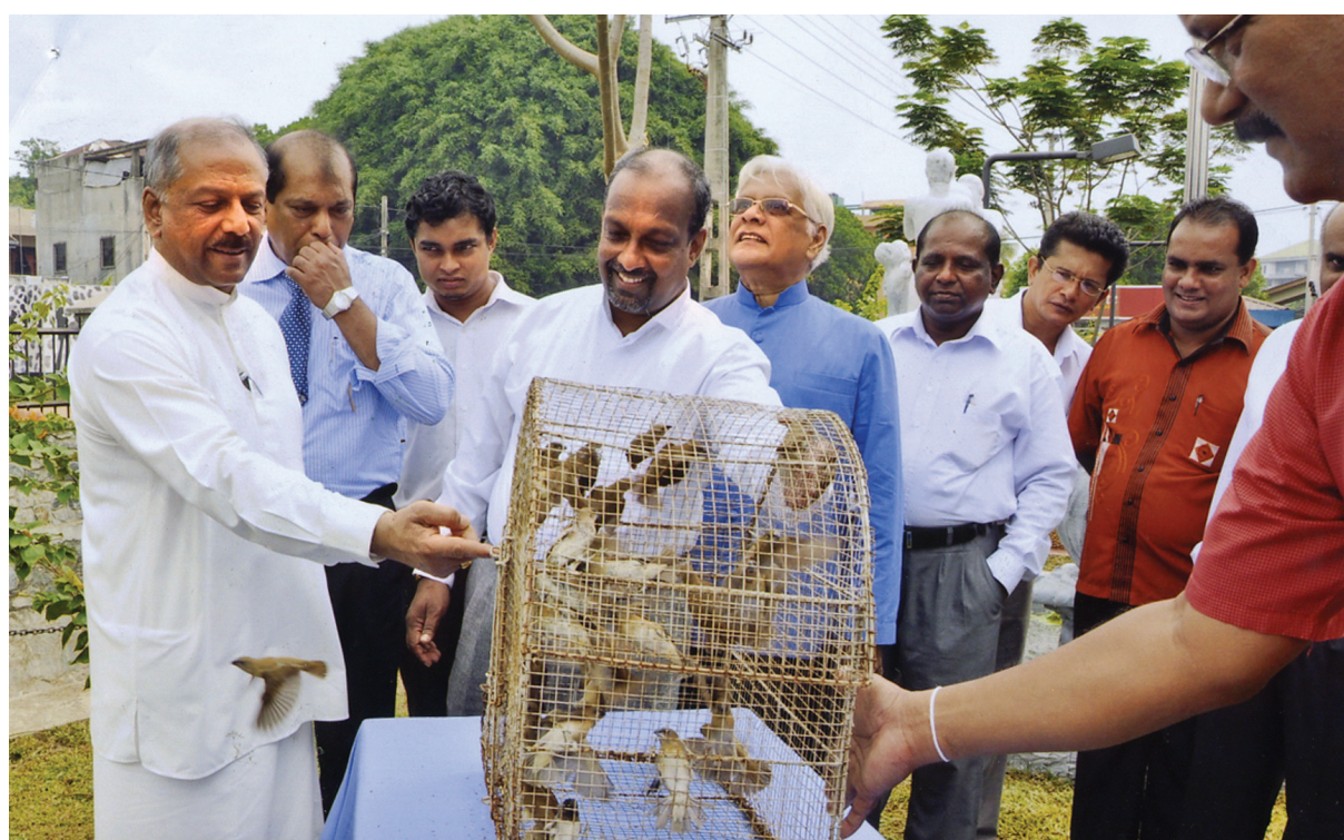
Minister Dinesh Gunawardena releasing birds.