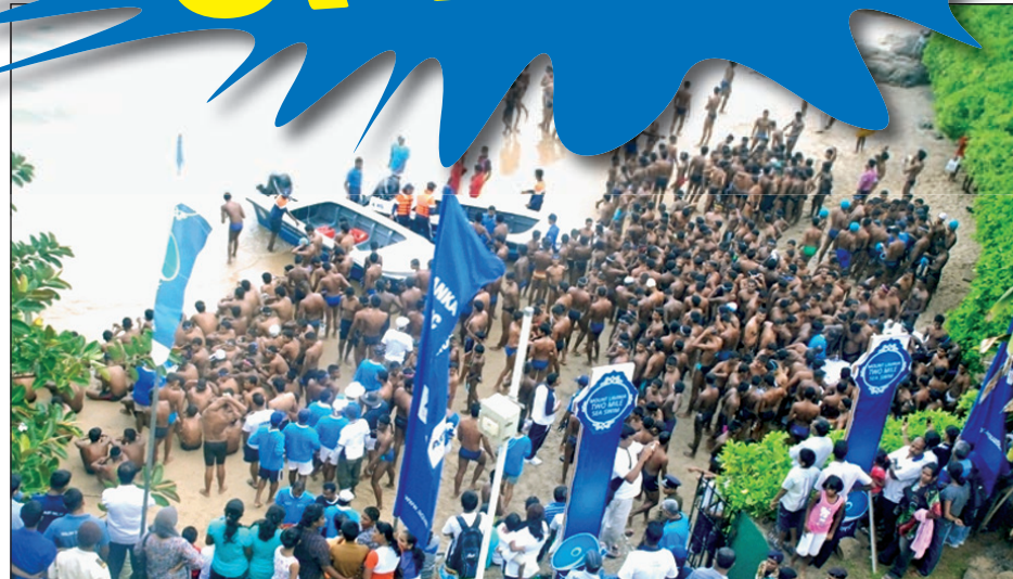
Swimmers at the start