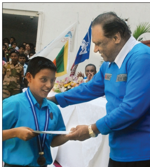
Lyceum International won youngest boy competitor Challenge Cup-1