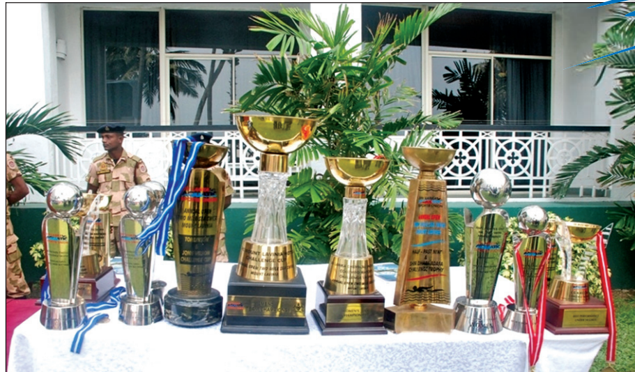
The trophy table

The much anticipated Annual Two Mile Sea Swim organized by the Sri Lanka Aquatic Sports Union (SLASU) and hosted by Mount Lavinia Hotel (MLH) witnessed over 800 participants between the ages of 12 years and 70 years from over 20 aquatic clubs across the island. The event was held at the waters of the iconic Mount Lavinia Hotel bay on the March 2 and 3. The event was also sponsored by MAS Holdings, Milo and Maliban.