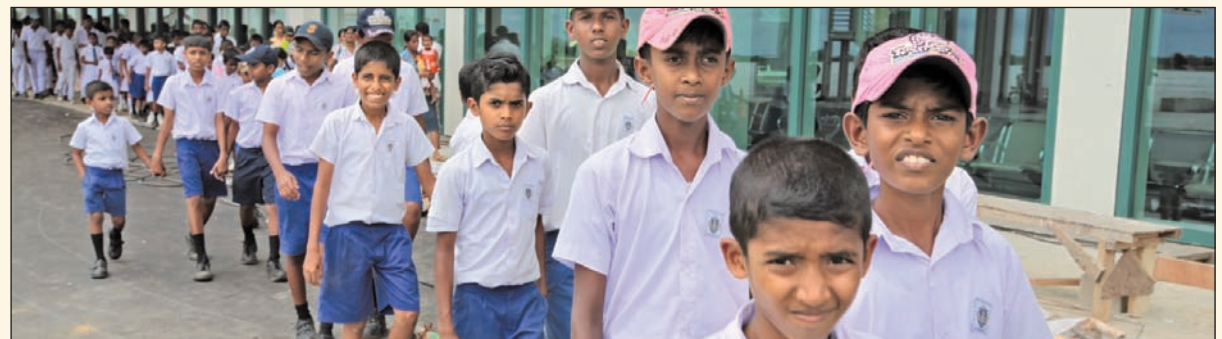
Schoolchildren who had the privilege to visit the airport