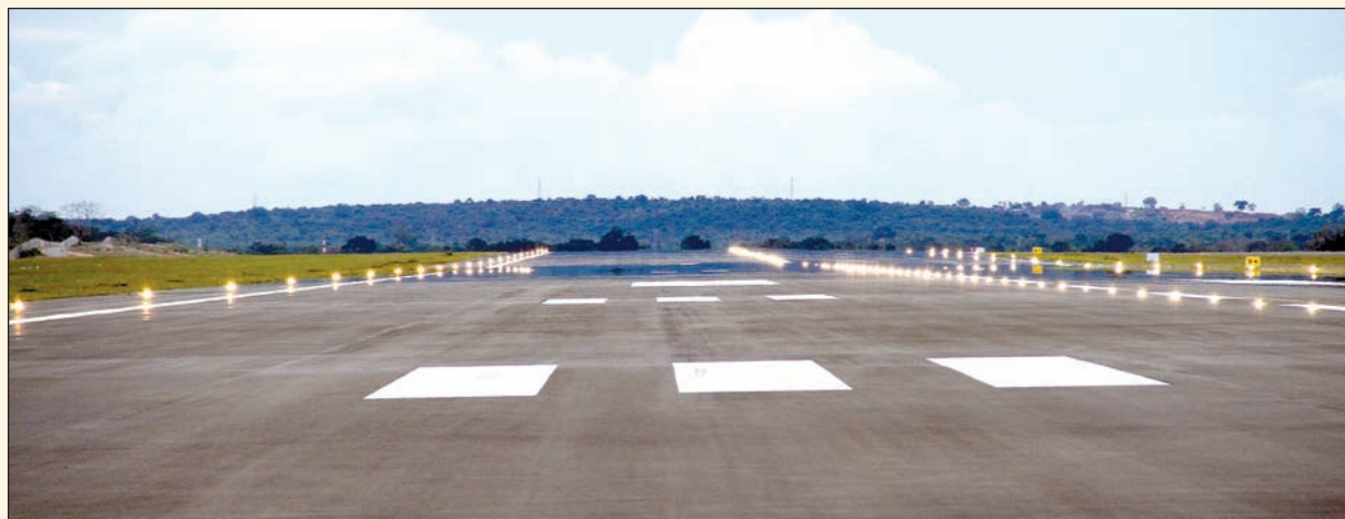
A section of the runway