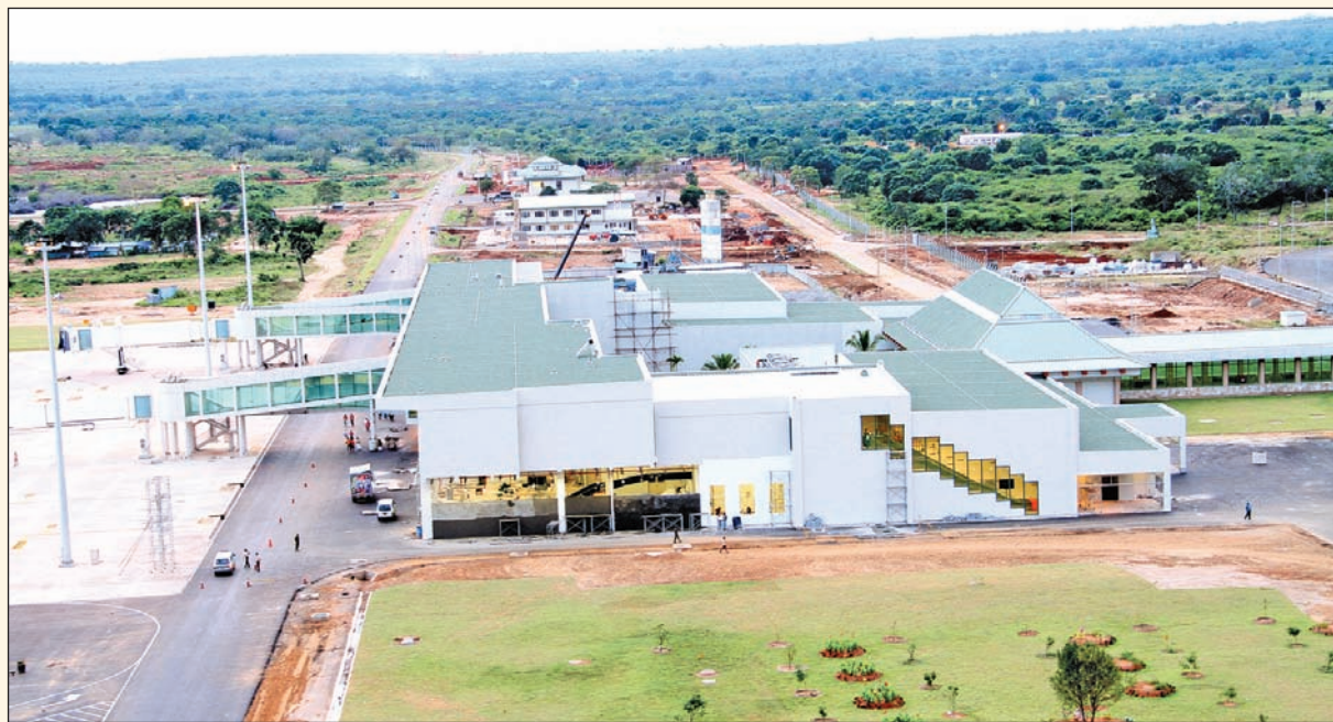
An aerial view of the Mattala Rajapaksa International Airport