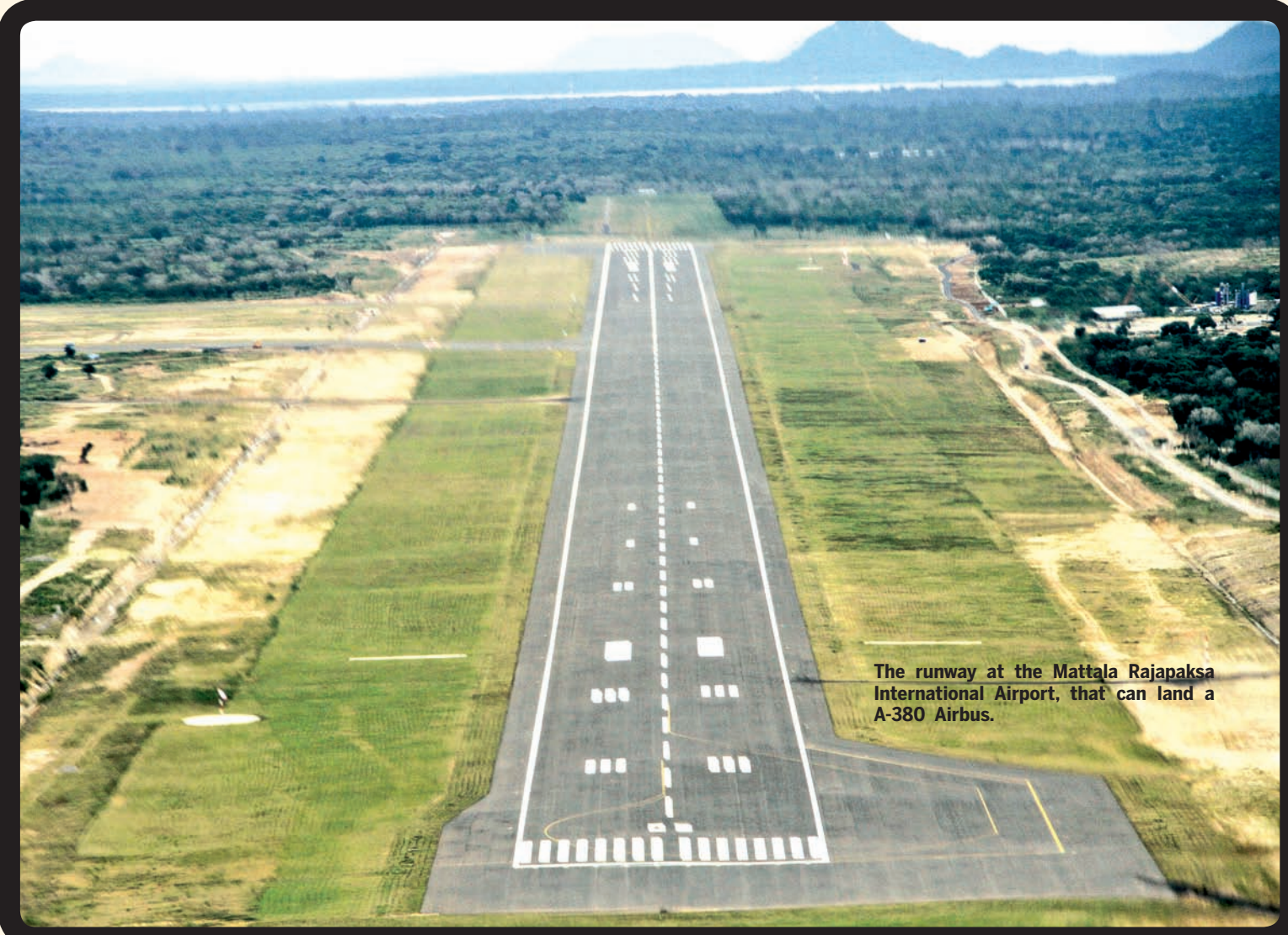
The runway at the Mattala Rajapaksa International Airport, that can land a A-380 Airbus.