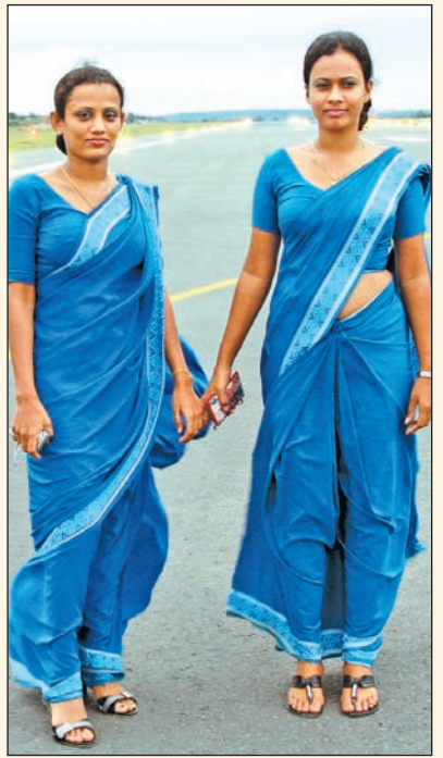
Ground staff, Mattala airport.