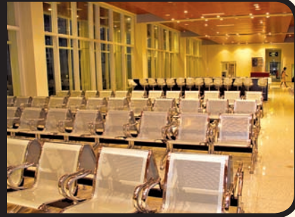
The plush interior