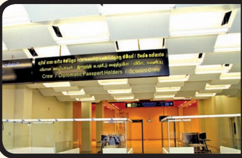
The Immigration section