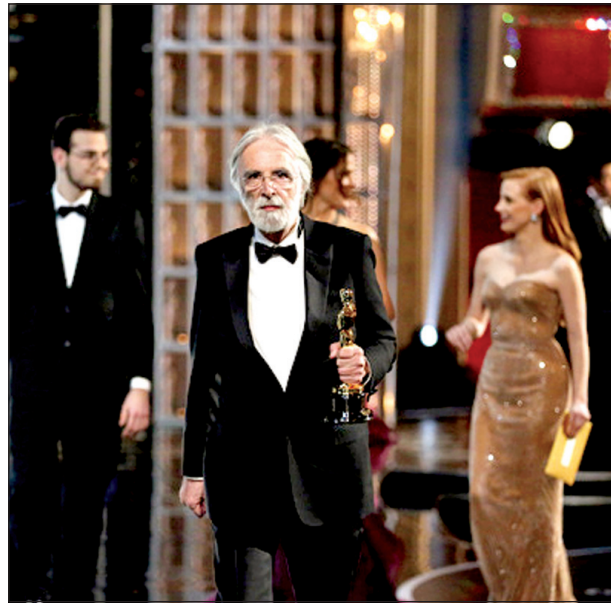
Foreign Language Film: Amour - Austria