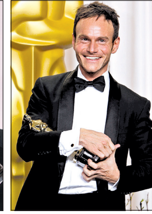
Music Original Score: Life of Pi - Mychael Danna