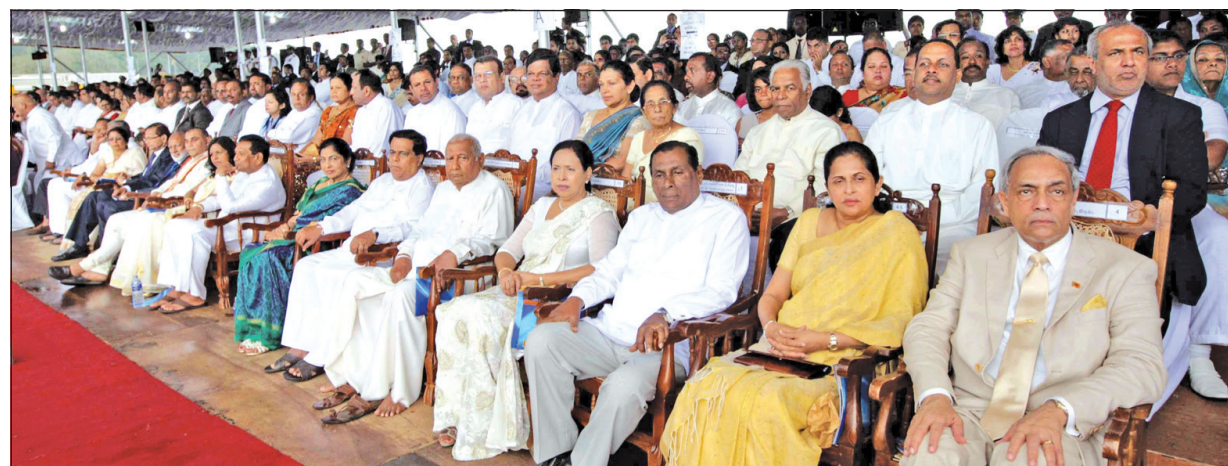
Chief Justice Mohan Peiris and a section of the Ministers and special dignitaries at the Independence Day celebrations