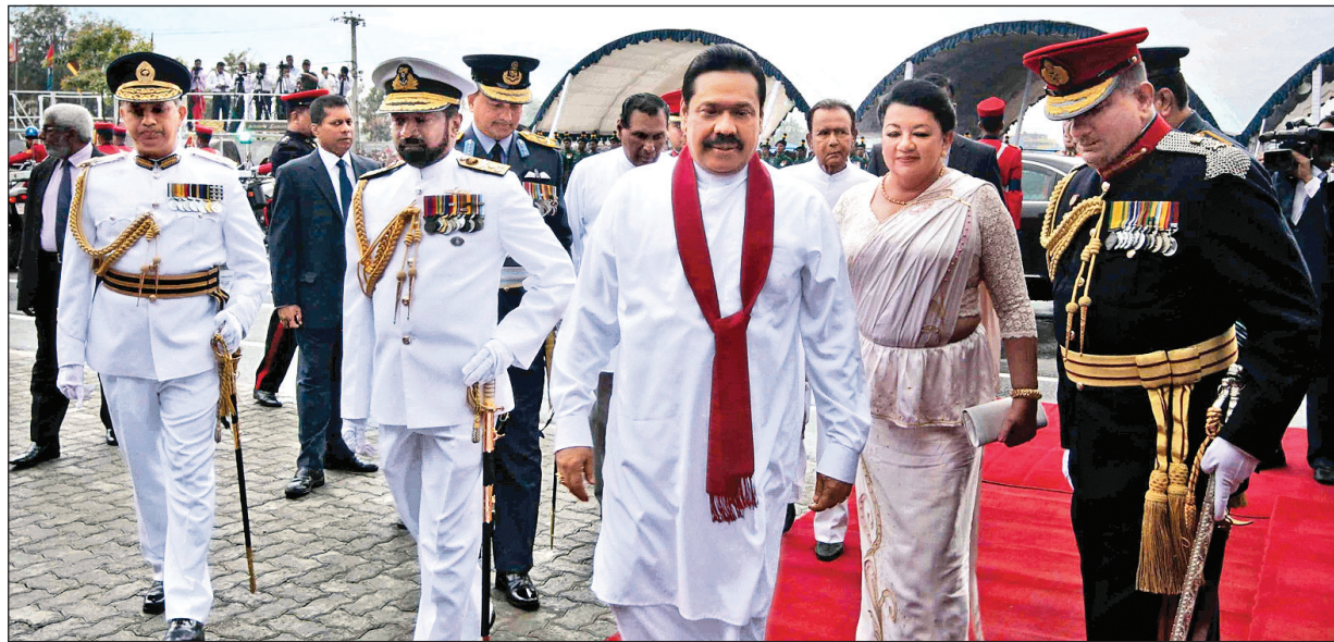
President Mahinda Rajapaksa and First Lady Shiranthi Rajapaksa accompanied by service commanders on arrival