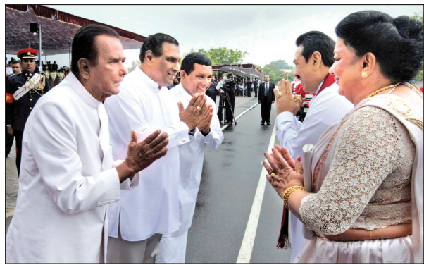
President Mahinda Rajapaksa and First Lady Shiranthi Rajapaksa being welcomed on the occasion by Prime Minister D M Jayaratne and Public Administration and Home Affairs Minister W D J Seneviratne