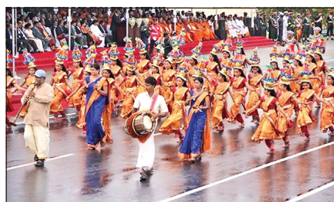
Various dances as part of the cultural show