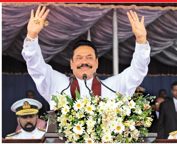
President Mahinda Rajapaksa greeting the massive crowds