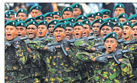
Special Task Force personnel