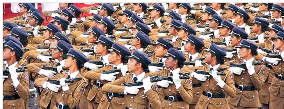
Female Police personnel