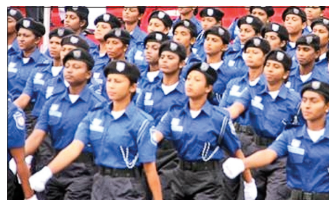
National Youth Corps