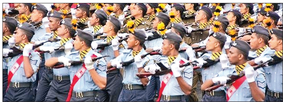
Air Force personnel