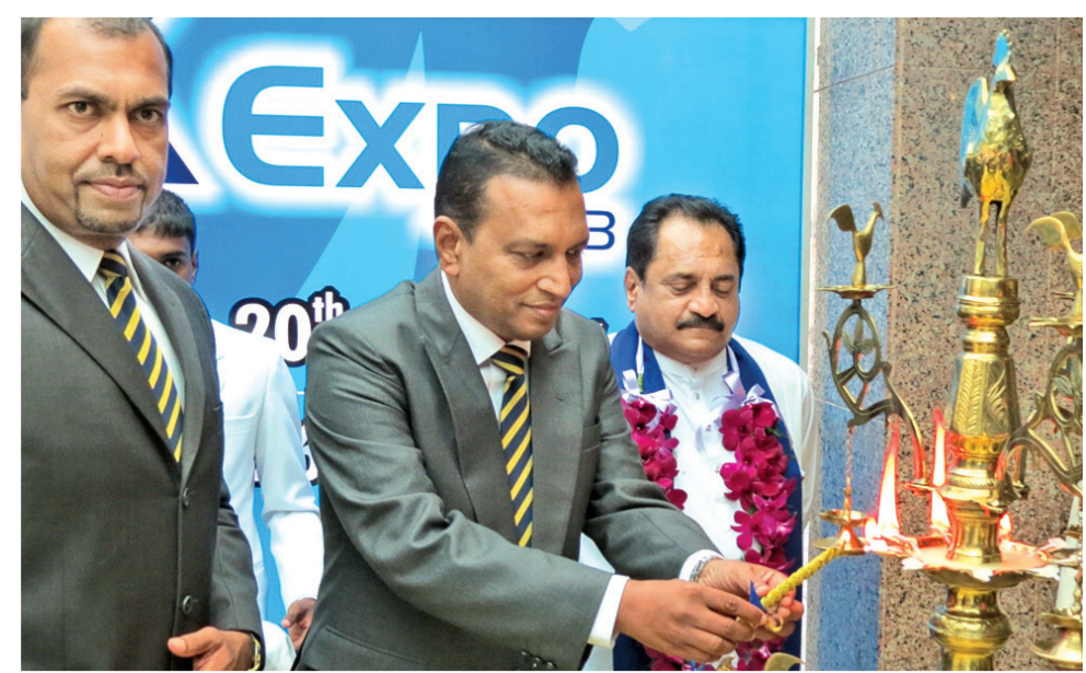
Some highlights of the opening day