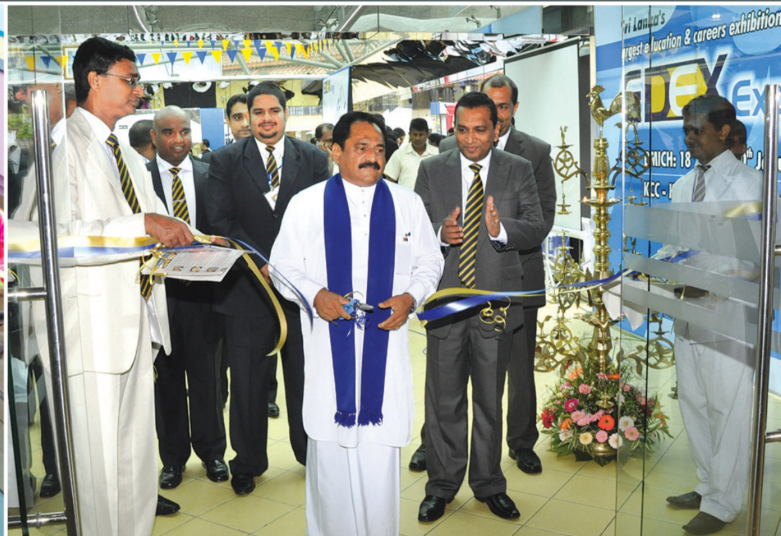
Central Province Governor Tikiri Kobbekaduwa opening the event