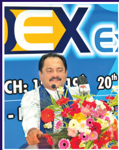
Central Province Governor TIKIRI KOBBEKADUWA addressing the gathering