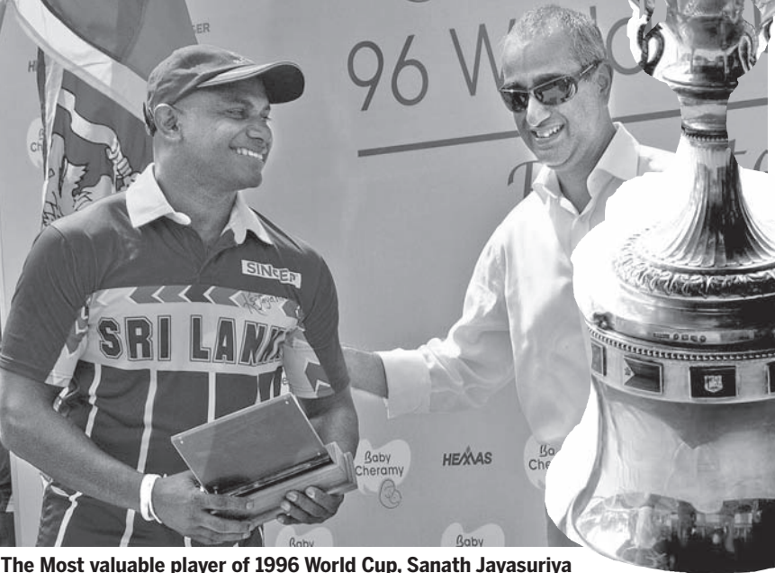
The Most valuable player of 1996 World Cup, Sanath Jayasuriya