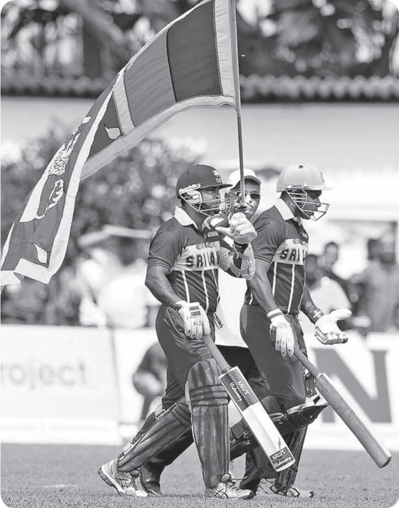
Just like the good old days, the pair that revolutionised world cricket, Sanath Jayasuriya and Romesh Kaluwitharana wals to the centre with Percy holding the lion flag