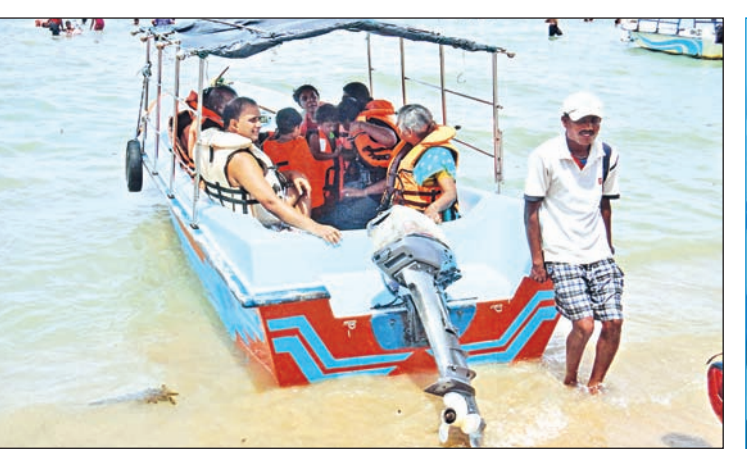
In view of the peaceful environment prevailing in the Eastern Province. The number of foreign and local tourists visit Pasikudah in Batticaloa. Here local tourists are seen enjoying a ride in the Pasikudah beach.