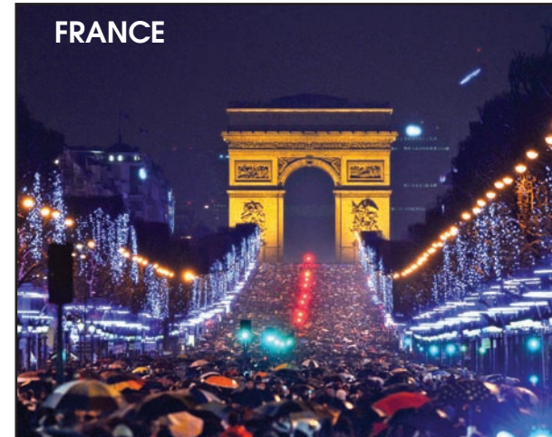
People gather on the Champs-Élysées avenue in Paris to celebrate the New Year, late on December 31, 2012.