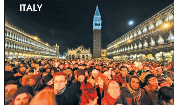
People gather to celebrate the New Year at the Piazza San Marco in Venice, early on January 1, 2013.