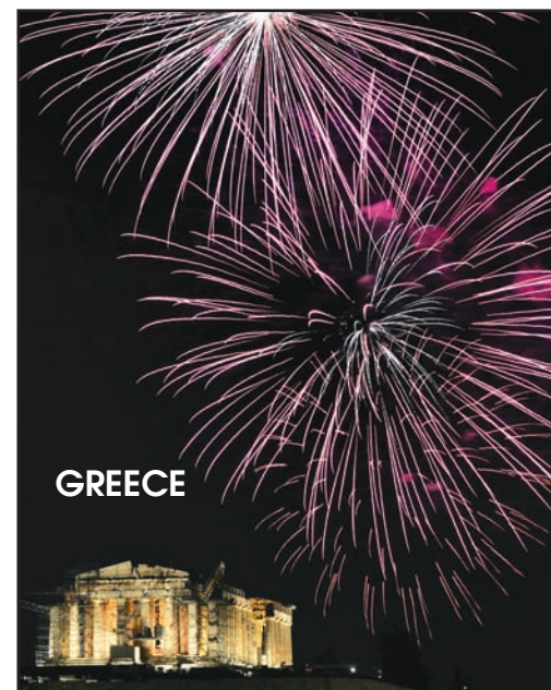
Fireworks illuminate the ancient temple of Parthenon atop the Acropolis hill during the new years celebrations in Athens on January 1, 2013.