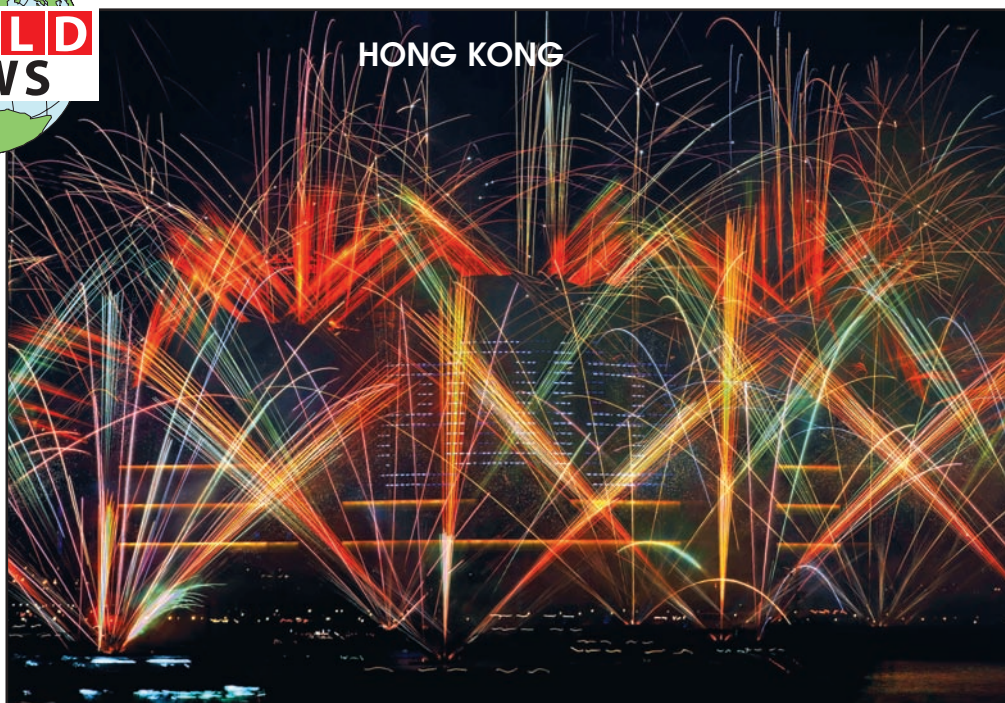
Fireworks explode over Victoria harbour to celebrate the new year, in Hong Kong on January 1, 2013.