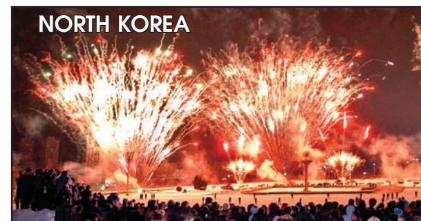
North Koreans watching fireworks displayed in Pyongyang for New Years Day.