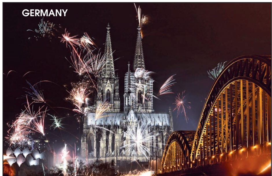
Fireworks light up the Dom church on the Rhine river in Cologne, Germany after midnight on January 1, 2013, as part of the New Year celebrations.