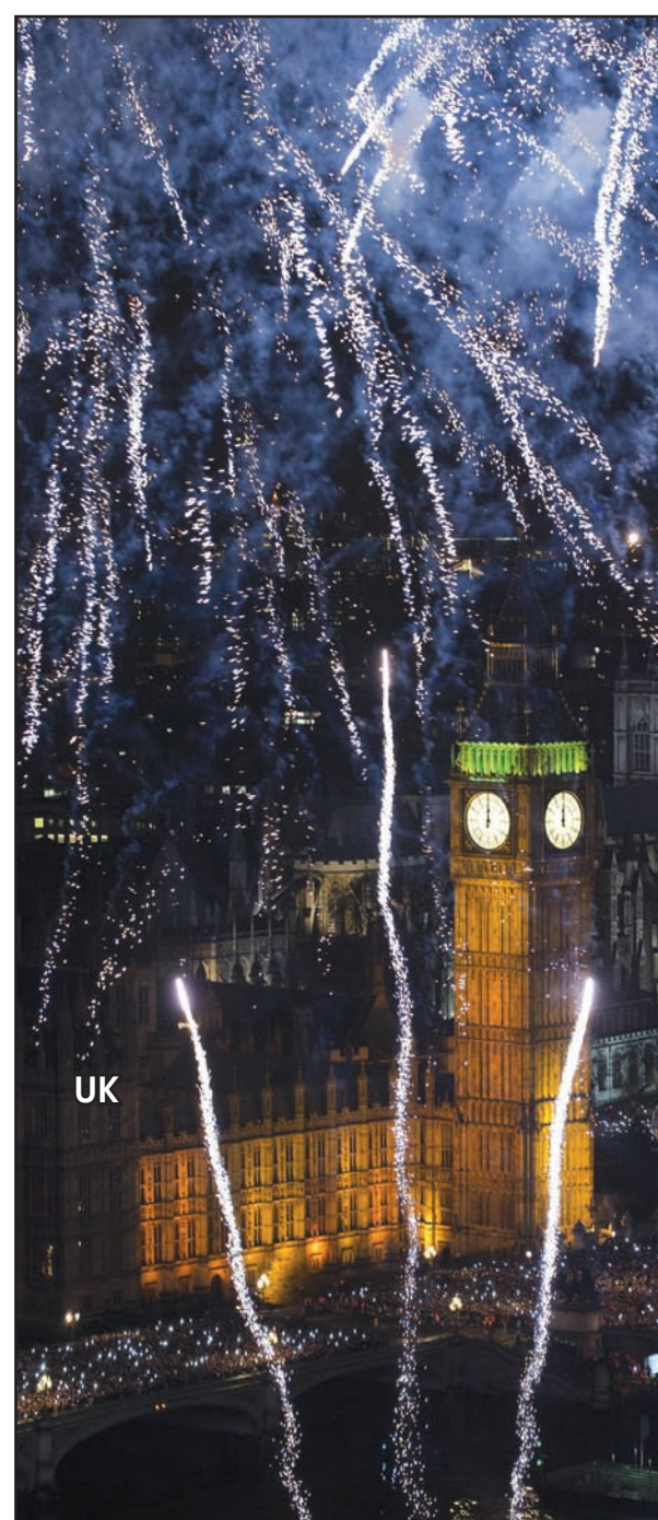
Fireworks light up Big Ben during the New Year celebrations in central London just after midnight on January 1, 2013.