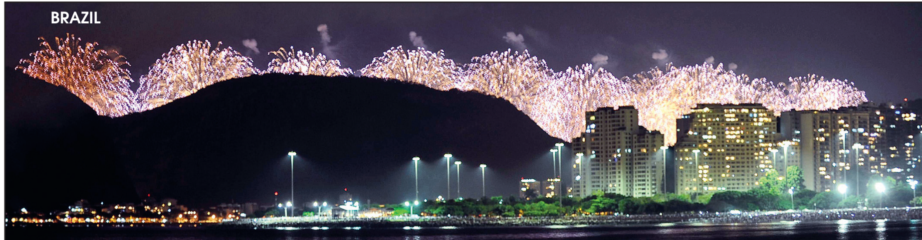
Fireworks illuminate the night sky before Sugar Loaf Mountain in Rio de Janeiro to mark the start of New Years Day on January 1, 2013.