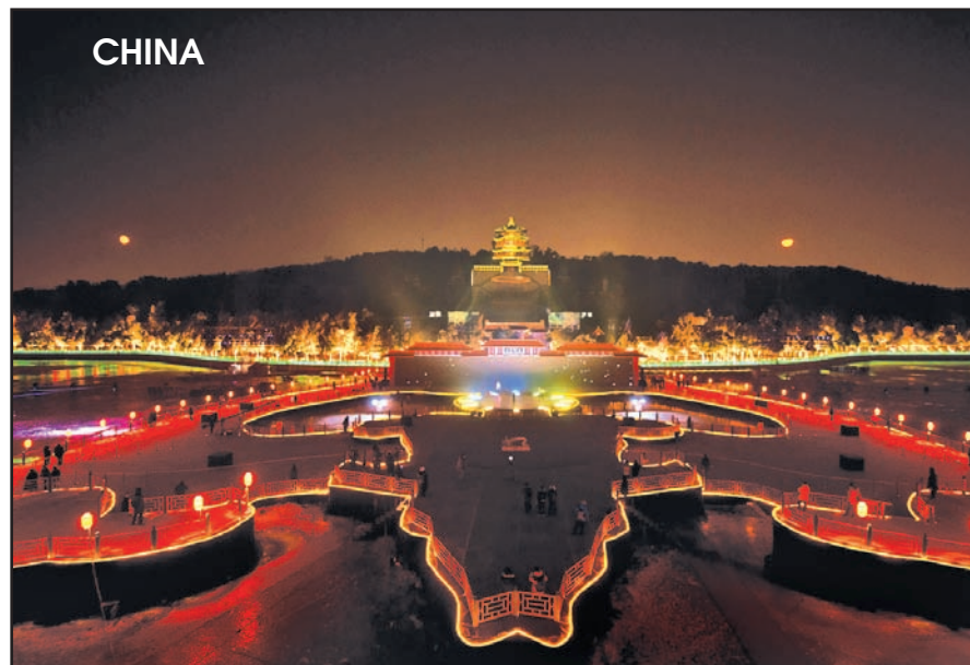
A lightshow illuminates the Summer Palace during a new year count-down event in Beijing on December 31, 2013.