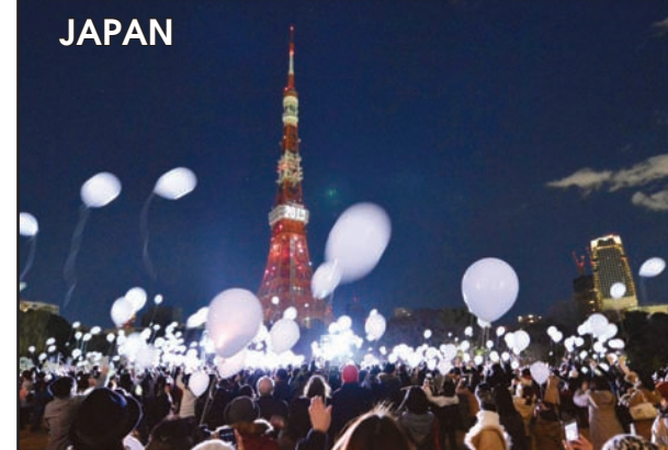
People release balloons to celebrate the New Years during an annual countdown ceremony produced by the Prince Park Tower Tokyo, flagship of the Prince hotel chain on January 1, 2013.