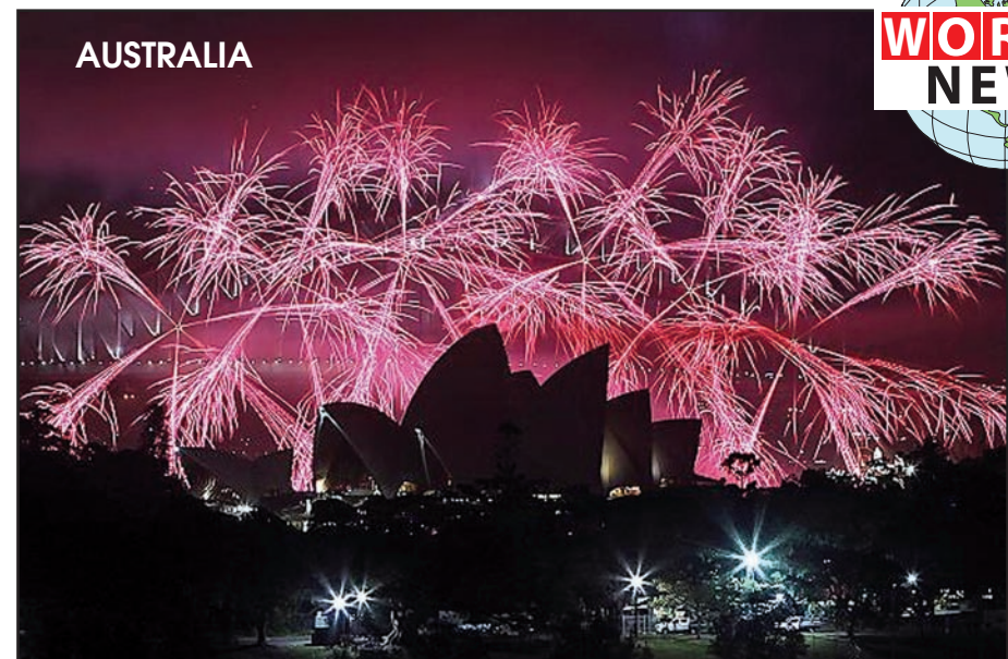
Australian pop princess Kylie Minogue got the 2013 party rolling as she counted down the seconds to a spectacular fireworks display over Sydney Harbour. Minogue, who is celebrating 25 years in showbiz, was asked to choose the theme of this year's midnight show and plumped for the theme "embrace". The Harbour Bridge was duly emblazoned with a pair of Minogue-style lips, which counted down in unison with more than a million. Here, fireworks explode behind the Sydney Opera House.