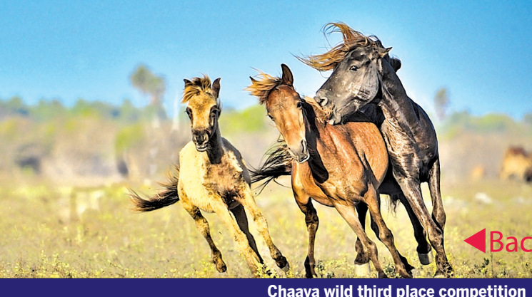
Chaaya wild third place competition