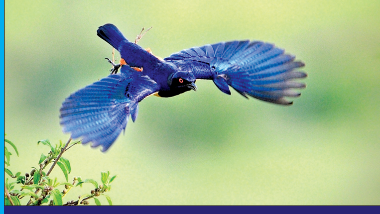
PSSL UPI Gold Medal 2012 - Blue Bird asai Mara at Kenya