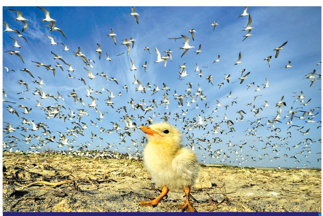
NatGeo 2012 Editors Choice, Photo of the day and Photo of the Month - Greater Crested Tern Chick at Talaimanar