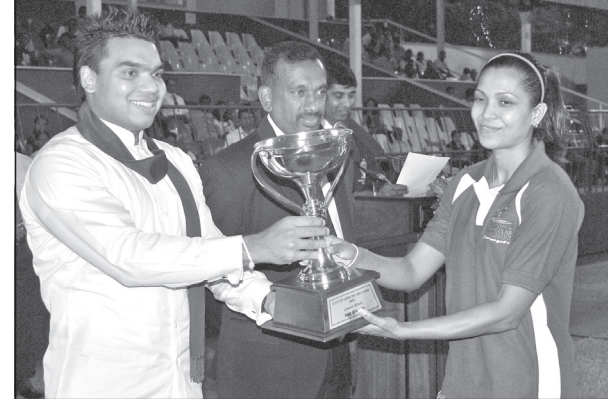
Sports Festival at the Sugathadasa Stadium on Sunday