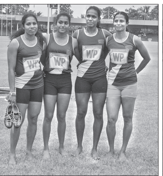
Women's 4x400m champions Western Province team Men's 4x400m champions Southern Province team