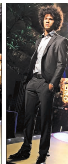
Highlights of the chic fashion show.