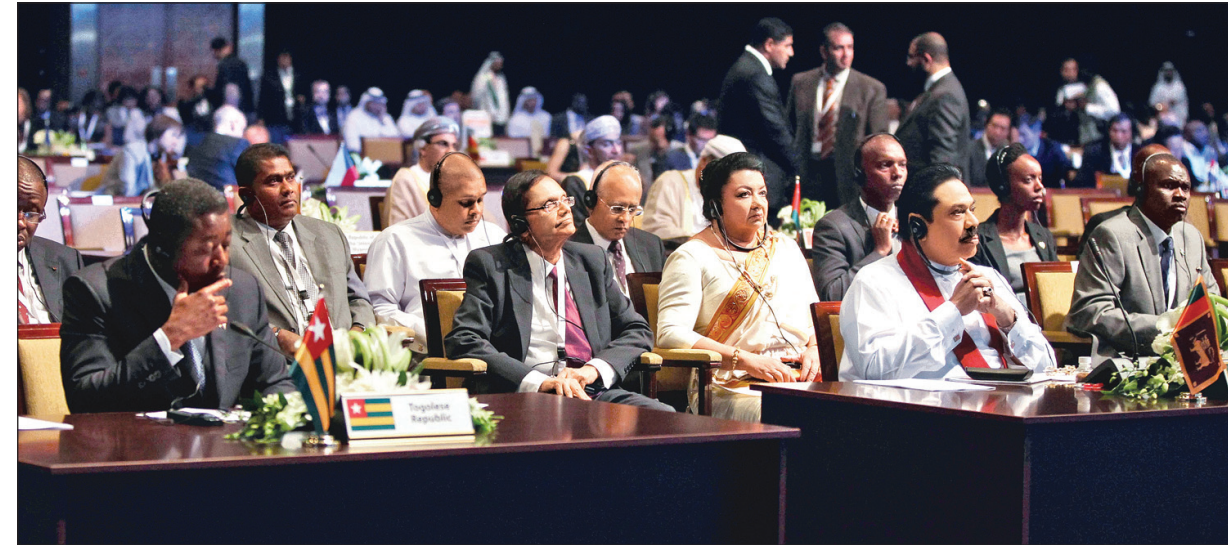
President Mahinda Rajapaksa, First Lady Shiranthi Rajapaksa, External Affairs Minister Prof. G.L. Peiris and other delegates at the Forum.