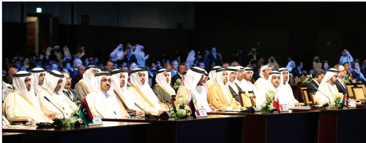
Some of the delegates at the World Energy Forum