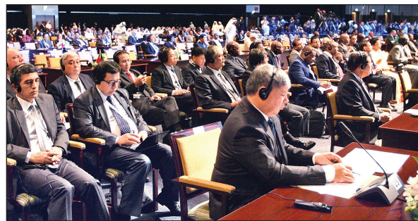
A section of the delegates