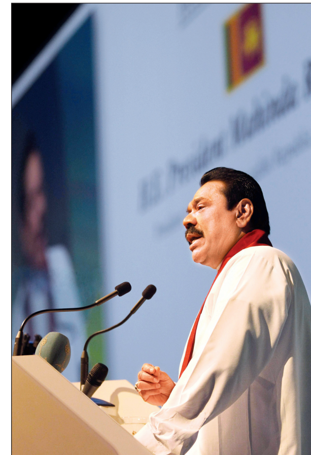
The President addressing the gathering at the World Energy Forum