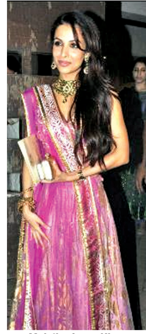
Malaika Arora Khan