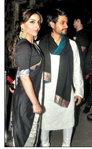
Soha Ali Khan and Kunal Khemu