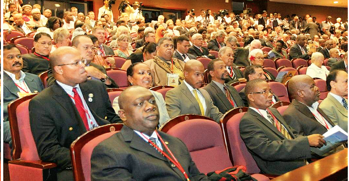
First Lady Shiranthi Rajapaksa with delegates of the Commonwealth Parliamentary Association