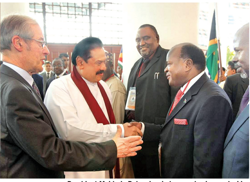
President Mahinda Rajapaksa being received on arrival by officials of the Commonwealth Parliamentary Association