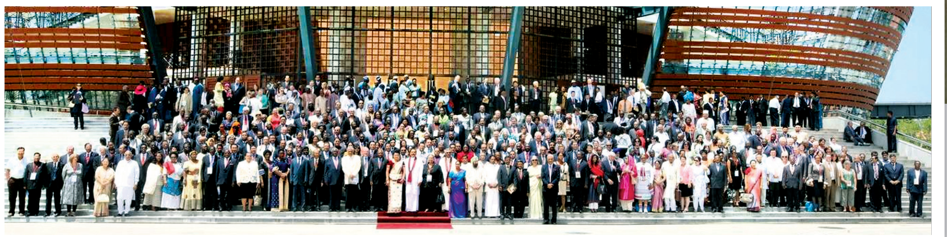
President Mahinda Rajapaksa posing for a group photo with representatives of the Commonwealth countries who participated at the inauguration of 58th Commonwealth Parliamentary Conference.