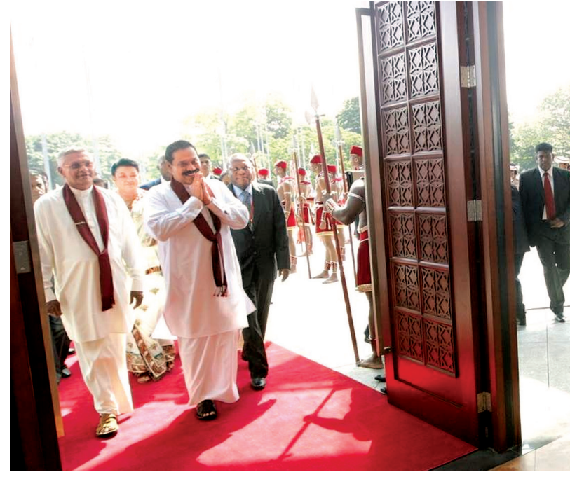
Opposition Leader Ranil Wickremesinghe greeting President Mahinda Rajapaksa