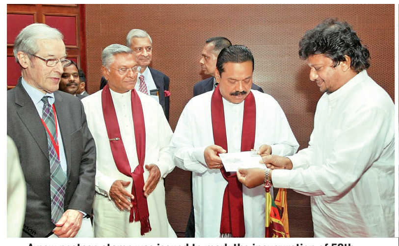
A new postage stamp was issued to mark the inauguration of 58th Commonwealth Parliamentary Conference in Colombo. Here, the First Day Cover being presented to President Mahinda Rajapaksa by Postal Services Minister Jeevan Kumaratunga