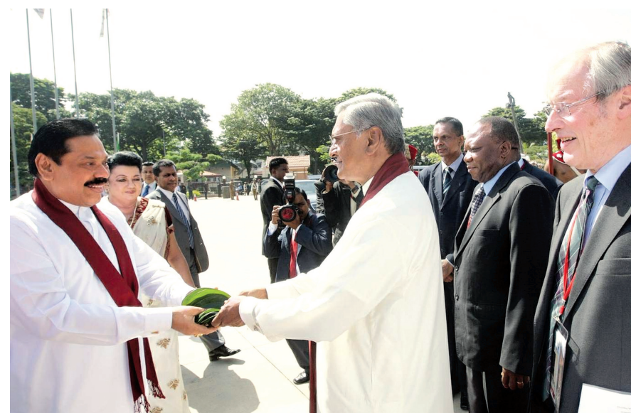
Speaker Chamal Rajapaksa receiving the Chief Guest President Mahinda Rajapaksa on arrival for the 58th Commonwealth Parliamentary Conference.

President Mahinda Rajapaksa officially inaugurated the 58th Commonwealth Parliamentary Conference at the Nelum Pokuna Mahinda Rajapaksa Theatre yesterday. The Conference brings together 850 Parliamentarians and staff from 54 countries. This will be the biggest event to be held in Sri Lanka since the end of terrorism and an opportunity for the country to showcase first hand the progress made to global policy makers. During the sessions 'The impact of the informal economy on economic diversification in small states', 'Strategies to increase women's representation in Parliaments in small states' and 'Measuring progress and well-being beyond GDP in small states' were discussed. The sessions will be held until September 15.