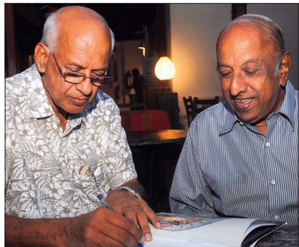
Autographing the book