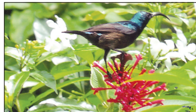
Blue humming bird