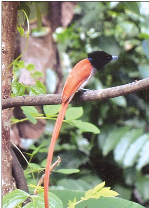
Paradise fly catcher

be seen on both rose apple trees. Among them the Golden Oriole and the Jungle Pigeon popularly known as Manilagoya are very attractive. Observing the bird's behaviour and hearing their melodious tone is a mind-soothing hobby. Sometimes it is similar to a different meditation. Some village area people feed these flying friends with seeds, fruits, boiled rice or green gram kept in flat containers etc.