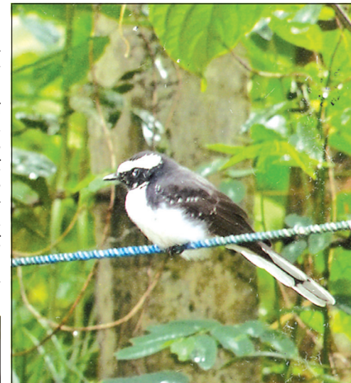
A kind of Magpie