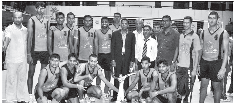
Champion SL Ports Authority team.