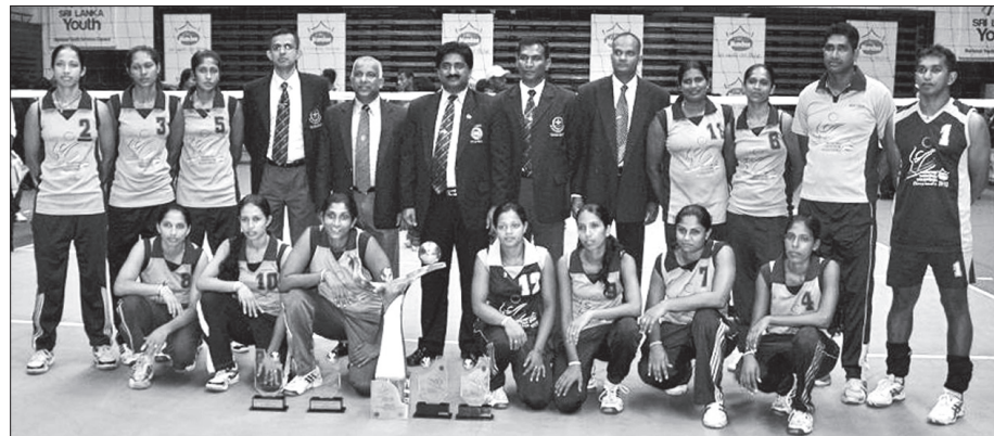
Womens Super League champions Air Force team and officials.