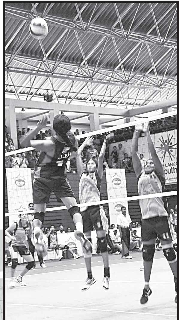
A Sri Lanka Foreign Bureau player jumps for the ball during the Women's Super league final.