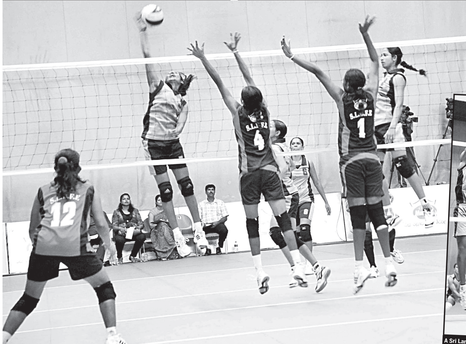
Action during the Womens Super league final.