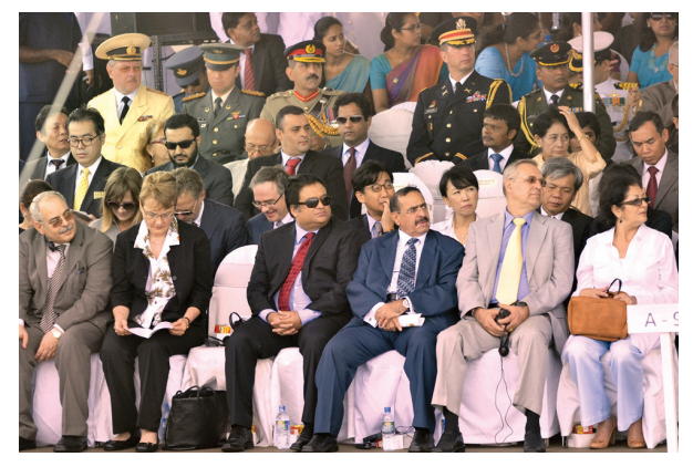
Foreign delegates at the Victory Day Parade.