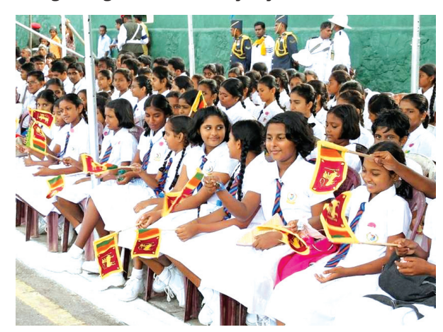
School children at the Victory Day parade.