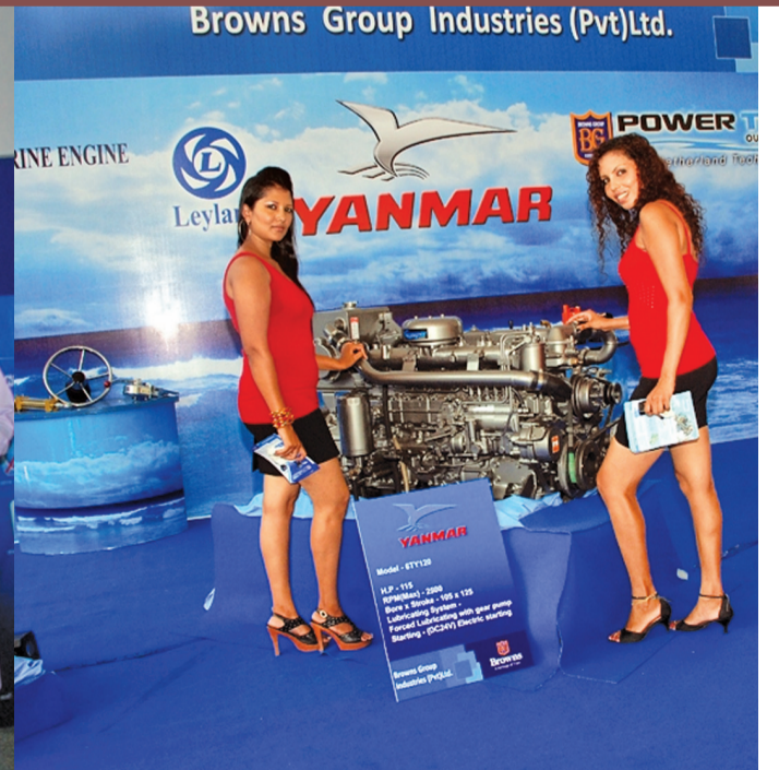
Models displaying a boat engine