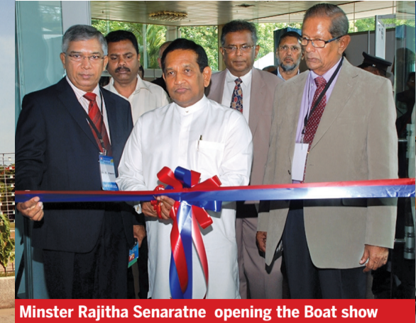
Minister Rajitha Senarathne opening the Boat show