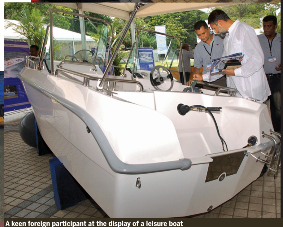
A keen foreign participant at the display of a leisure boat