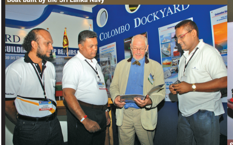
Foreign participant at the Colombo Dockyard stall