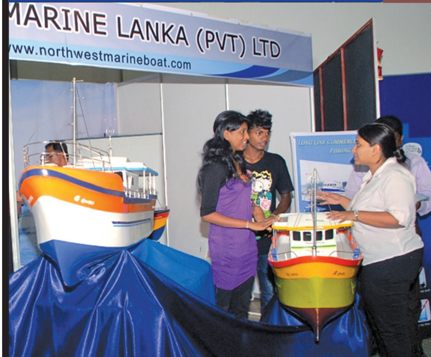
some of the highlight of the Boat show 2012