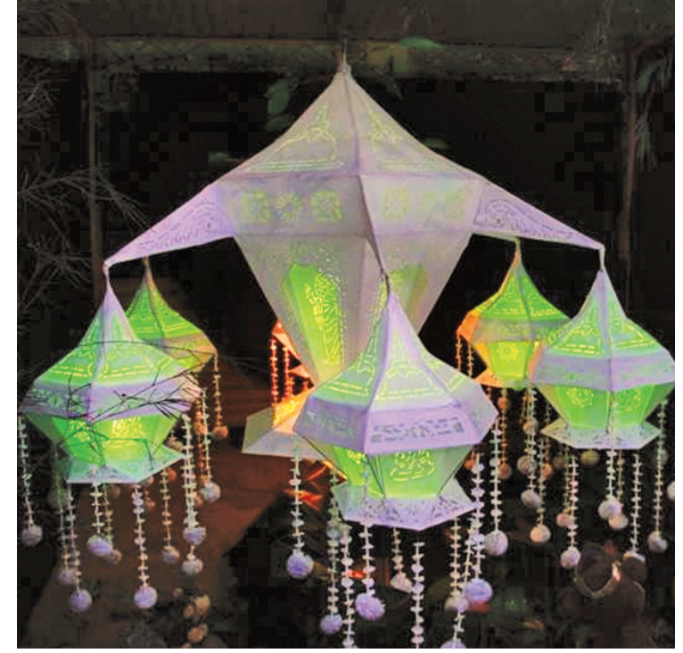
The HR Team's creation