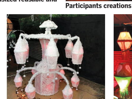
The illuminated creation