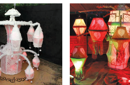
The Housekeeping team's creation The accounts team's ceation