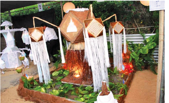
The engineering team that emphasized reusable and recycled material