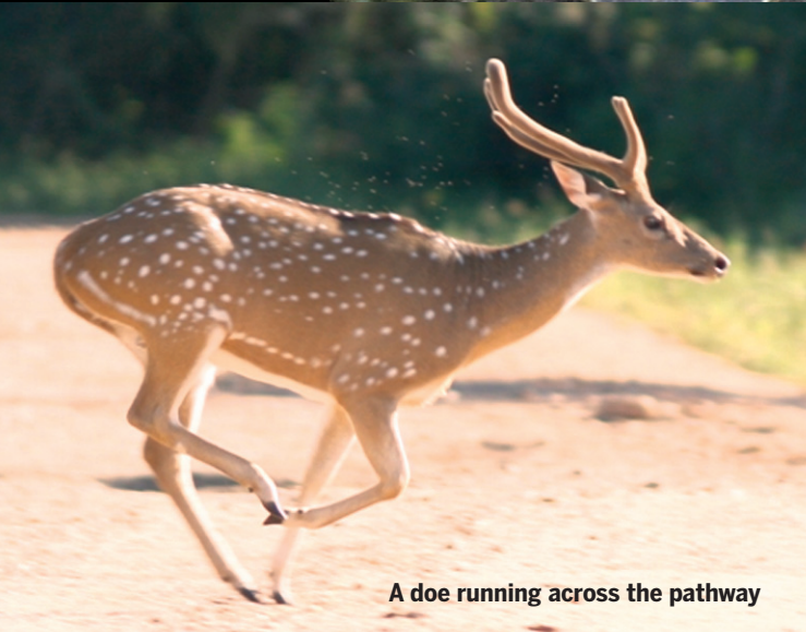
A doe running across the pathway