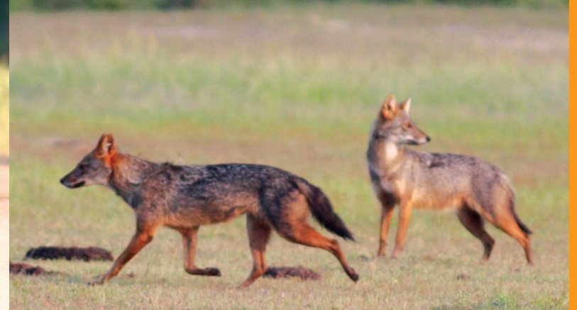
Foxes enjoying the sun