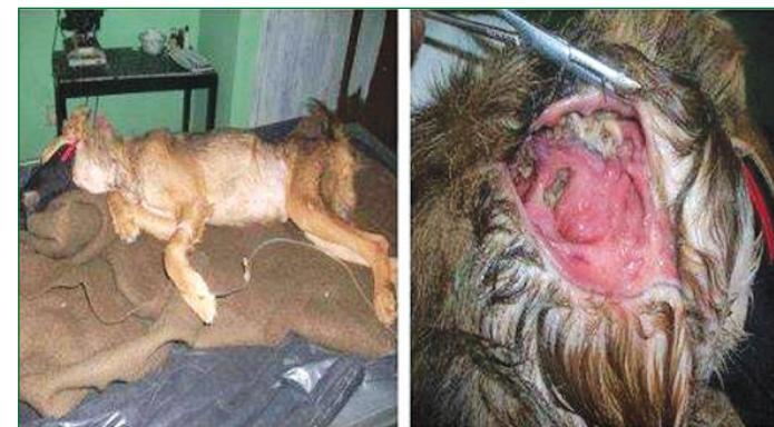
A very handsome Rasputin after surgery

He's a mix of a Pomeranian and normal breed and quite young. Please let us know if you would like to adopt him. He definitely was a house dog due to his temperament and behaviour and I know he would make an excellent pet so please help us and Adopt him.