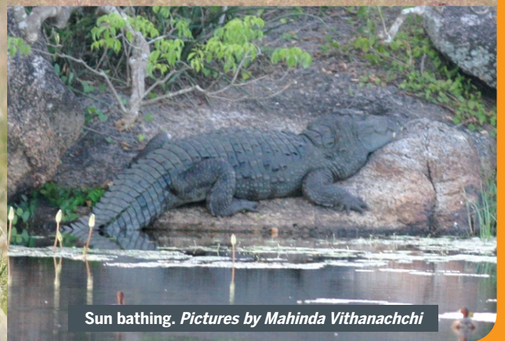
Sun bathing.