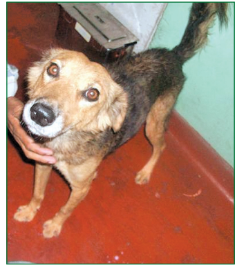
when he had to go the bathroom and all.

When one of the ADSL team members went there, he was smelling really bad and was lying down in pain. Why? His private area was cut in two - WHO CAN DO SOMETHING LIKE THIS - and there were about 100 maggots in that area - just imagine the struggle and pain he must have gone through