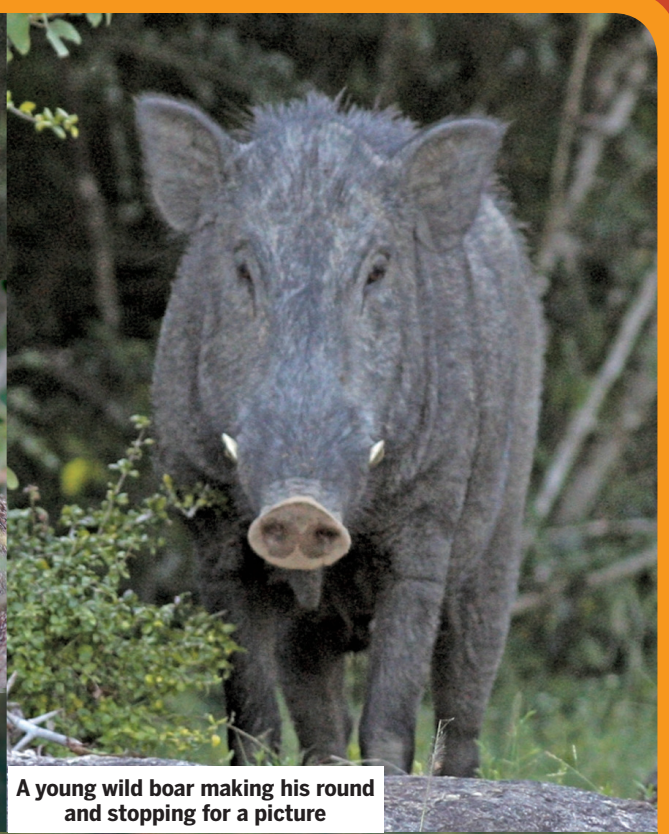
A young wild boar making his round and stopping for a picture