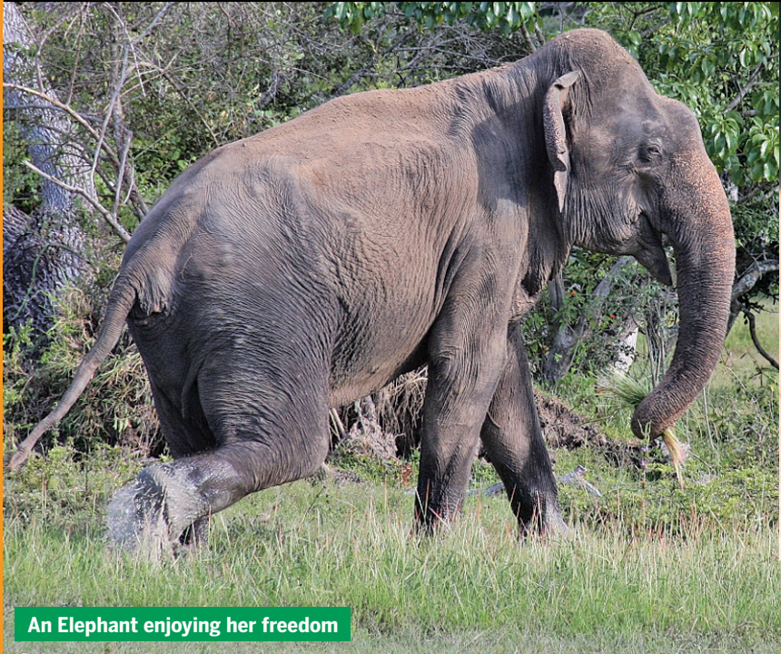
An Elephant enjoying her freedom