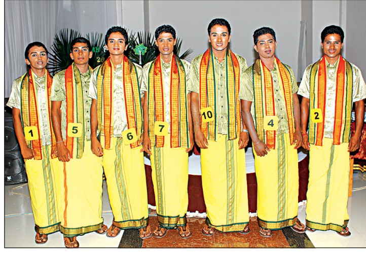
Mr Northern Province contestants