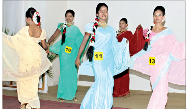
Miss Northern Province contestants