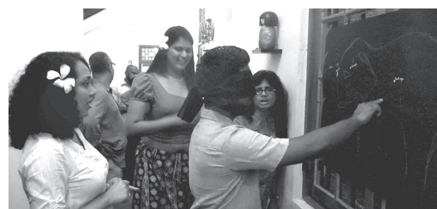
Enjoying the games