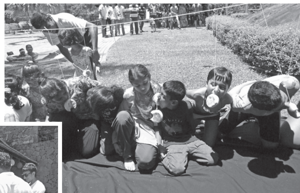
Children partaking in the bun eating game