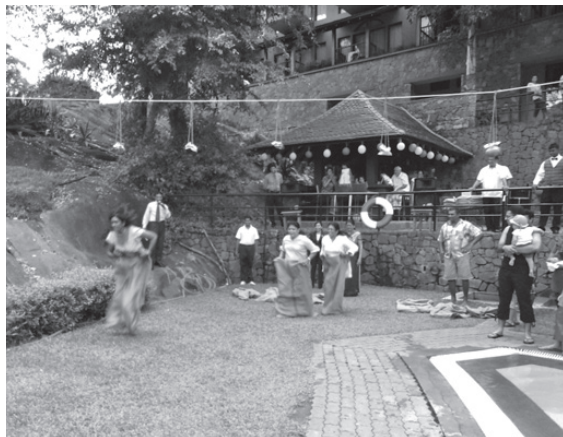
Goni bag running