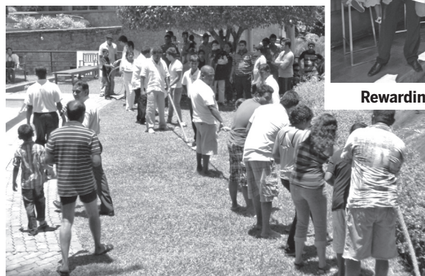
Ready for the Tug-o-war