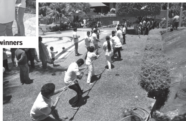
Pulling with all their mite