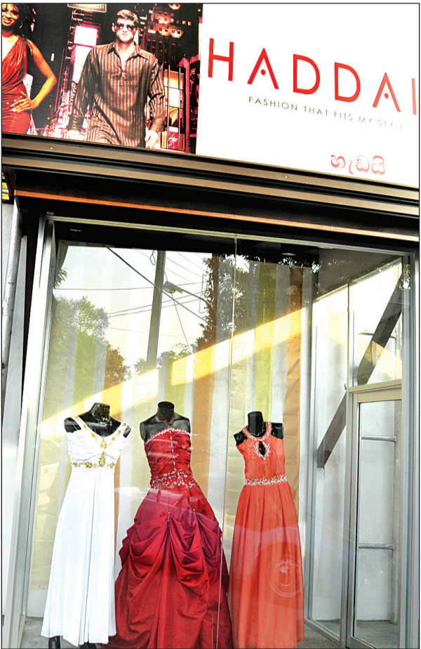
A front view of the store