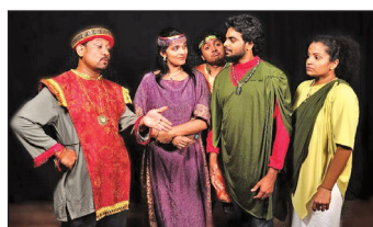
Umathusanwarusawa at the Tower hall

This week's 'Cultural Diary' brings you details about several other fascinating events happening in the city. Take your pick of stage plays, exhibitions or dance performance and add colour to your routine life. You can make merry and enjoy the adventures or sit back, relax and enjoy a movie of your choice. Make a little space to kick into high gear amid the busy work schedules to enjoy the exciting events happening at venues around the city. If there is an event you would like others to know, drop an email to eventcalendar25@gmail.com (Please be mindful to send only the essential details). Have a pleasant week.