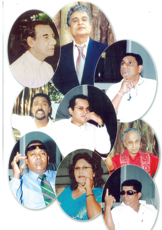
Asoka Senarath Mudalige's stage play Anaconda will go on boards at the Lumbini theatre on April 1 at 6.30 pm.