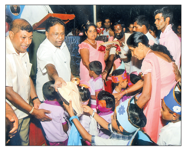
The Devinuwara Pradesheeya Sabha distributed a consignment of school informs, shoes, socks, bags and other educational equipment valued at Rs 1.8 million among students of 34 pre-schools in Devinuwara at a ceremony at the Devinuwara PS playground held under the patronage of Youth Affairs and Skills Development Minister Dallas Alahapperuma recently. Here minister Alahapperuma presenting a gift parcel to a student during the distribution ceremony. Provincial Minister Chandima Rasaputra, Provincial Council member Kanchana Wijesekara and Devinuwara Pradesheeya Sabha Chairman Sujeewa Wedage were also present on the occasion.