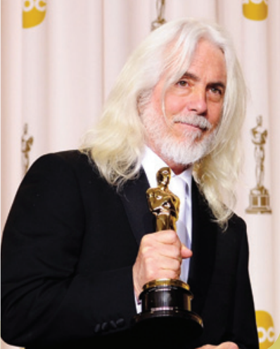
Winner for Cinematography for Hugo poses Robert Richardson