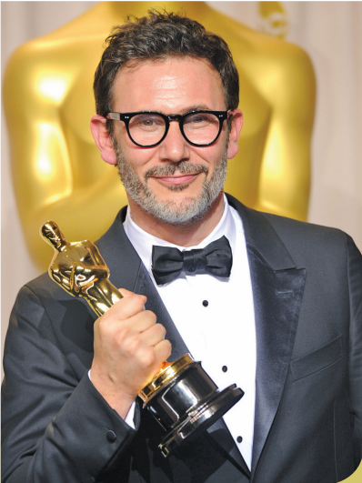
Best Director Michel Hazanavicius