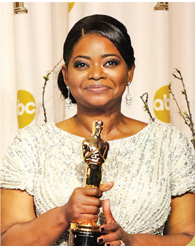
Winner of the Best Supporting Actress Actress Octavia Spencer