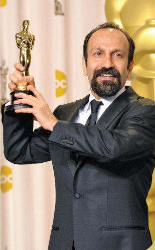
Winner of the Best Foreign Film Filmmaker Asghar Farhadi