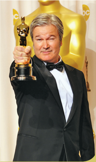
Winner of the Best Animated Film Gore Verbinski