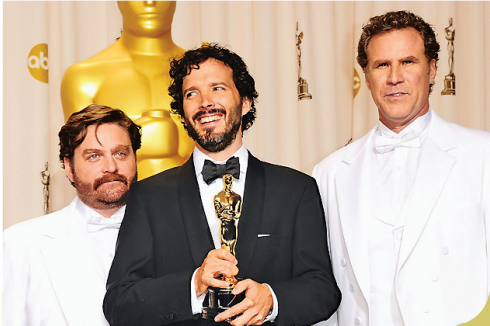
Winner of the Best Original Song Award for Man or Muppet from The Muppets Songwriter Bret McKenzie