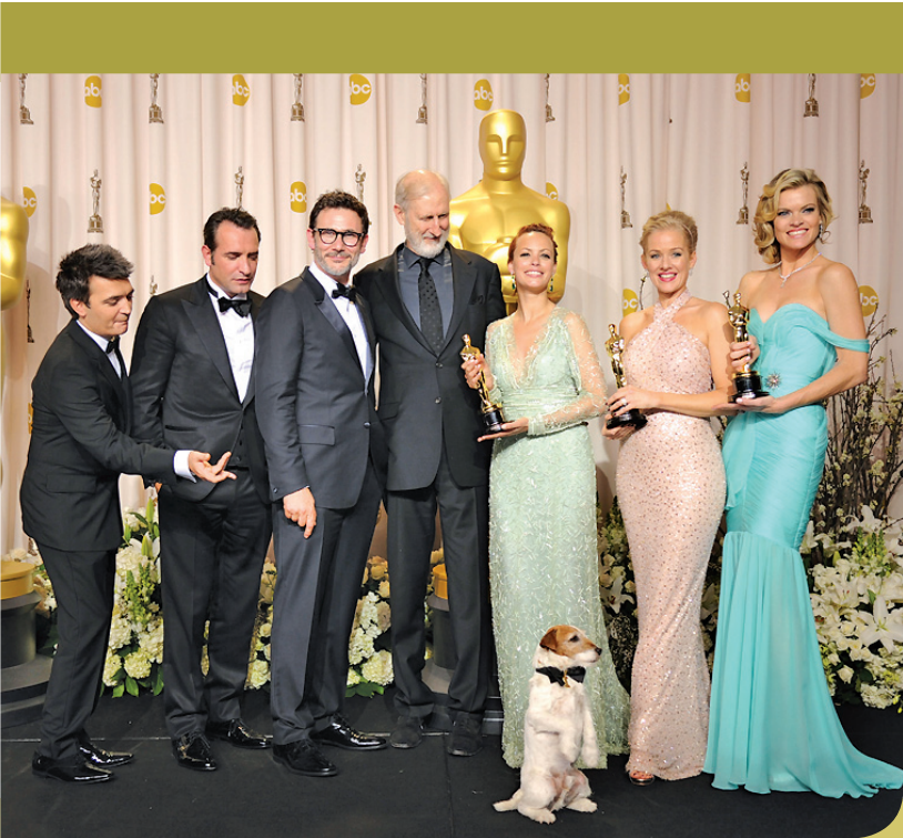
(L-R) Producer Thomas Langmann, actor Jean Dujardin, director Michel Hazanavicius, actors James Cromwell, Berenice Bejo, Uggie the dog, Penelope Ann Miller, and Missi Pyle pose in the press room after winning the Best Picture Award at the 84th Annual Academy Awards held at the Hollywood & Highland Center on February 26, 2012 in Hollywood, California.

With humor, dancing, singing and remembering those who passed on – the night really did turn out to be a great one. And surprisingly most of the ladies were wearing sleeveless Oscar designed gowns showing off all the curves in the right spots and the men well basically in a Tux.