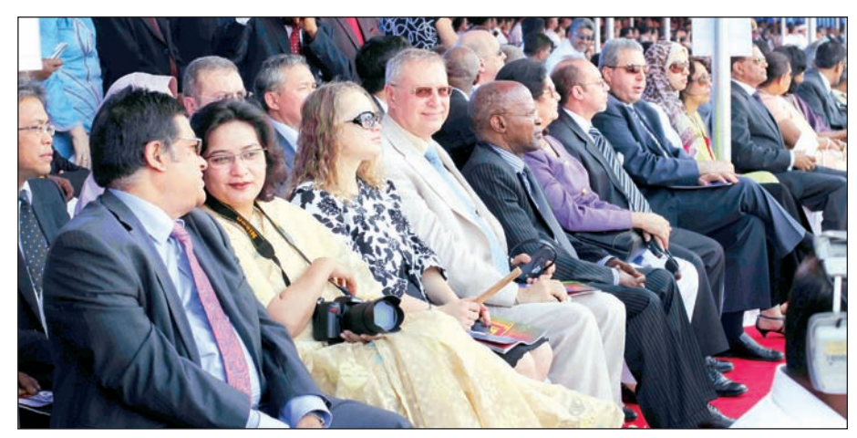
Diplomats and other foreign dignitaries