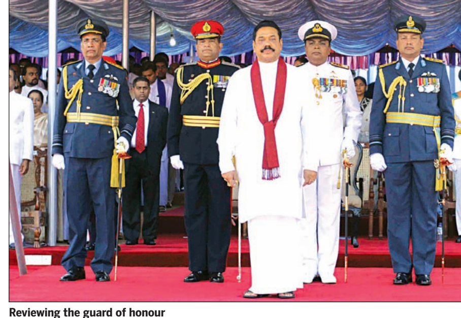
Reviewing the guard of honour