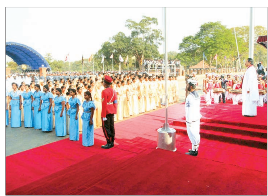
Children singing Jaya Mangala Gatha.