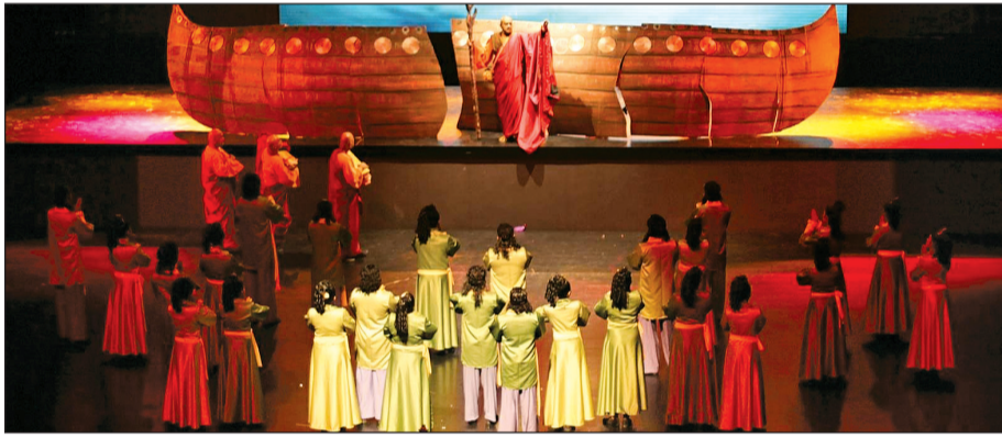
Sri Lankans performing