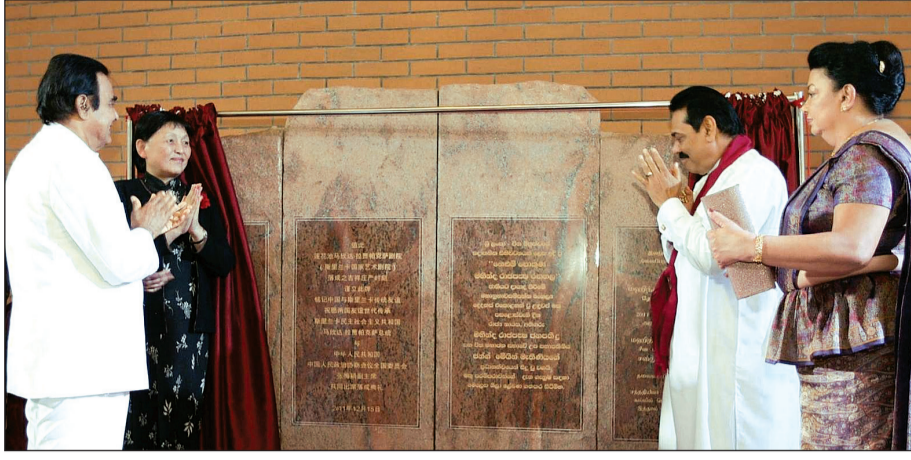
President and Vice Chairperson Zhang Meiying unveiling the memorial plaque. Prime Minister D M Jayaratne and First Lady Shiranthy Rajapaksa are also present.