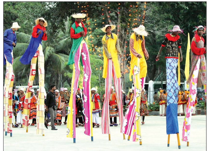
Stilt walkers performing