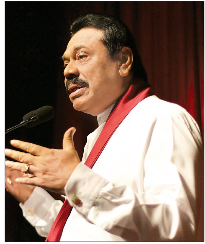
President Mahinda Rajapaksa addressing the inaugural ceremony