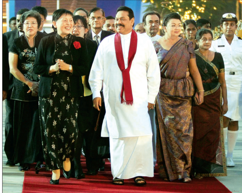
President Mahinda Rajapaksa entering the theatre premises with the First Lady and other distinguished guests