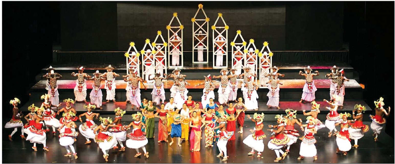
A performance by a Sri Lankan dance troupe