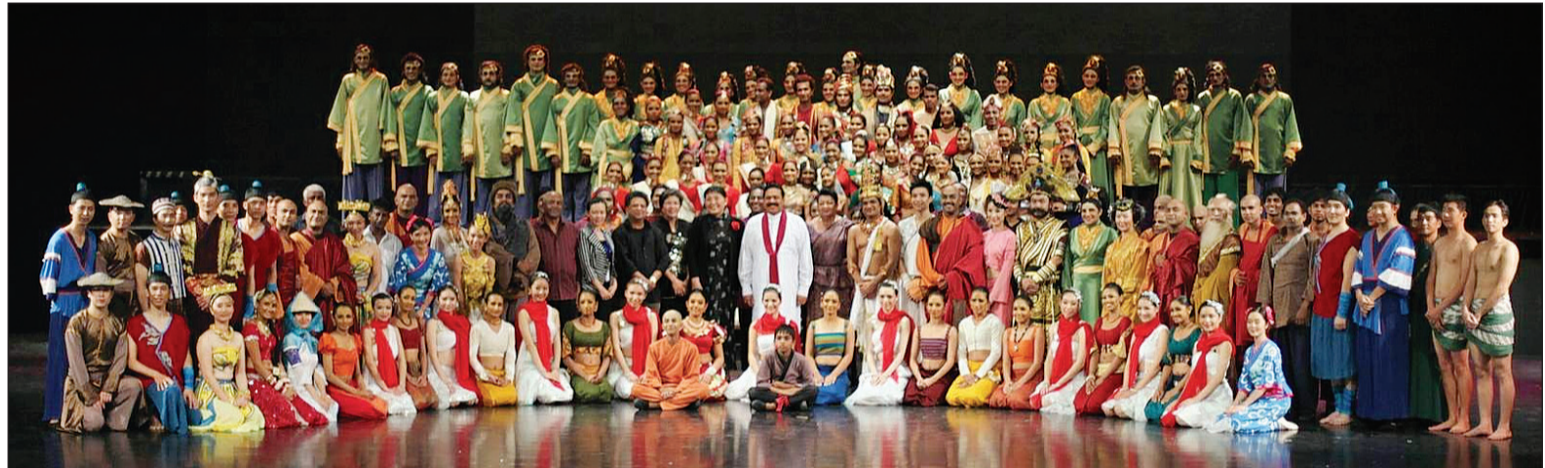
President Rajapaksa with the Sri Lankan and Chinese dance troupes