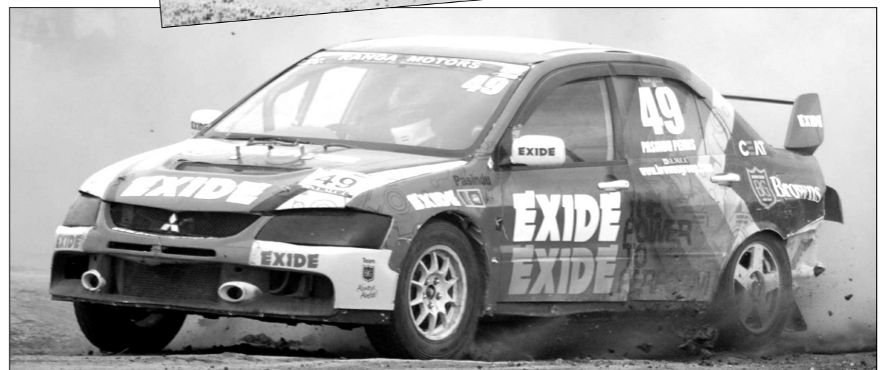
Pasindu Peiris performs a daughnut drift to entertain the crowd after winning the SL - GT - upto 3500 cc event