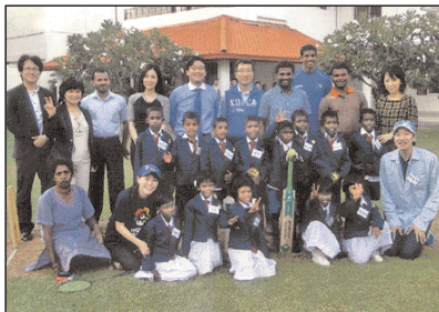
Students from the Bamarakele Tamil School, Nuwara Eliya at the Korean Ambassador's residence.