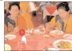
Participants enjoying their lunch