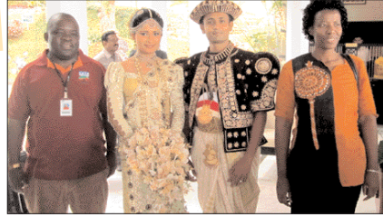
A Kandyan bride and groom