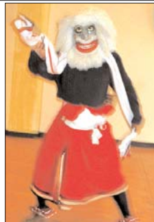
A dance item