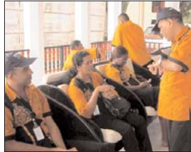
Meeting Inland Revenue officials from Sri Lanka