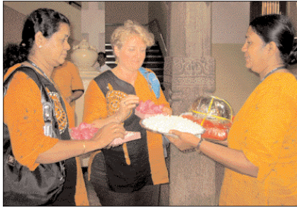
Participants paying obeisance at the Sacred Temple of the Tooth