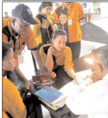
A participant with a palm reader