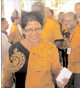
A warm welcome for the visitors at the Amaya Hotel