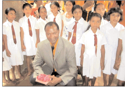
A delegate with some schoolchildren

The main objective of the conference is to increase capacity and capacity building of Commonwealth countries. Over the years, CATA has provided an excellent opportunity for tax administrators to meet, interact and discuss emerging tax issues and enhance their skills and knowledge.