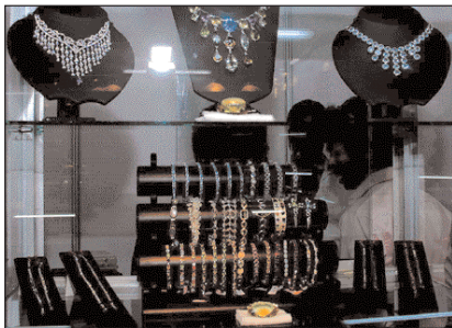
Exquisite gems on display