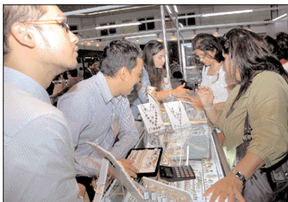
Buyers at another stall