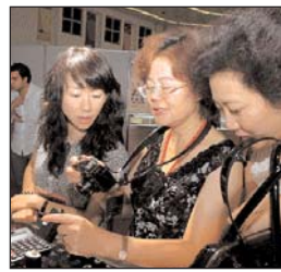
Some foreign buyers carefully examining gem stones