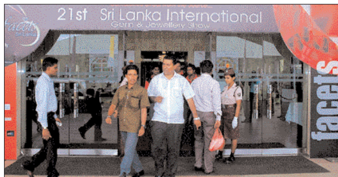
The entrance to the exhibition