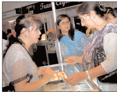
Pakistan High Commissioner Seema Ilahe Baloch going through some gems on display