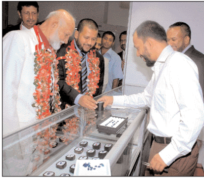
The chief guests at a booth examining some gems