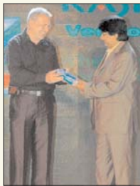
Foreign Employment Promotion and Welfare Minister Dilan Perera receiving a Kaspersky Anti-Virus 2012