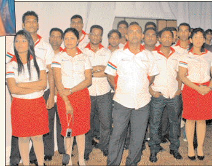
The Avian Technologies team