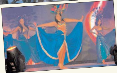
Some of the entertainment items that kept the crowd enthralled

Present at the launch were Foreign Employment Promotion and Welfare Minister Dilan Perera and Ambassador