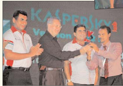
An award being presented