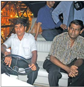
The pilot of the yacht