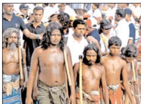
The Veddah community also joining in the walk