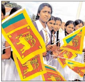
Girls celebrating freedom