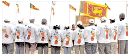
End of the Trail