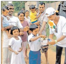
People contributing to the cause along the way