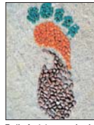
Trail footprint made by coloured stones