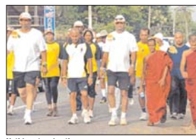
Nothing stopping them