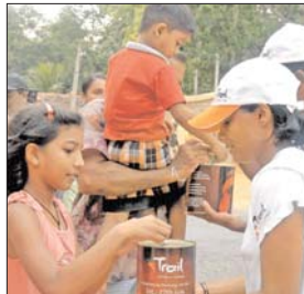
Children giving what they can