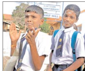
Schoolboys from the North cheering the walk