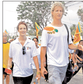
People from all walks of life