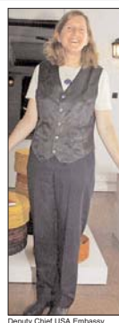
Deputy Chief USA Embassy Valerita Fowler