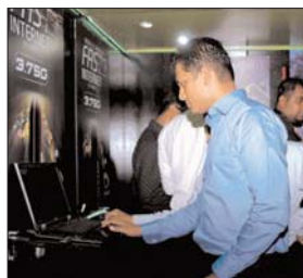
Experiencing the internet the Etisalat way