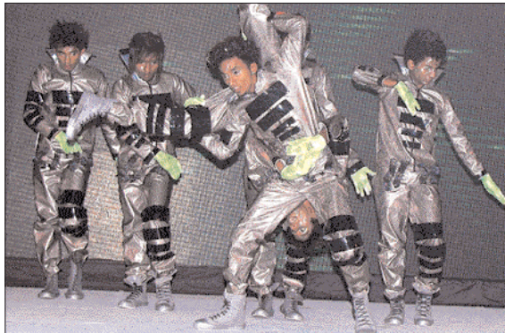
A dance item at the event