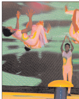
Another dance item