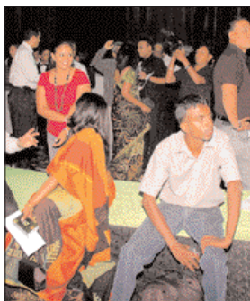
More invitees at the event