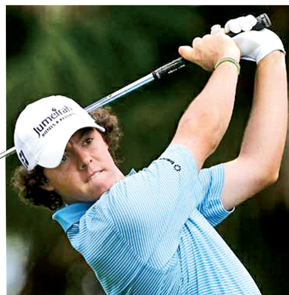
US Open champion Rory McIlroy