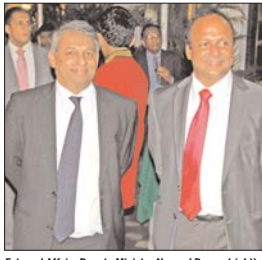
External Affairs Deputy Minister Neomal Perera (right) and friend