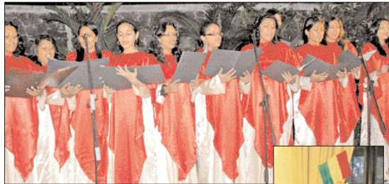
Soul Sounds giving their best