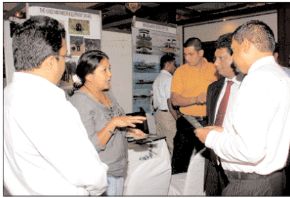
Exhibitors describing their products to the visitors.