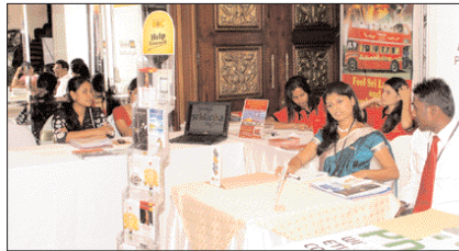
Exhibitors getting ready for the event