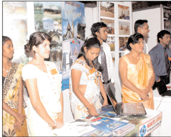
Kanto Lanka Travels stall

This mart provided a platform to develop business contact and interconnected services in keeping with the increased demand in the tourism industry.