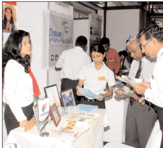
Hotel Dream Lanka (Pvt) Limited stall