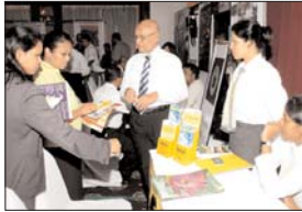
Hertz agency stall at the exhibition centre