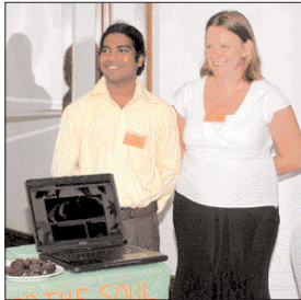
Exhibitors at the event