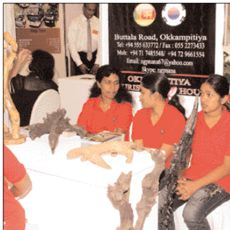
Wooden craft displayed at one of the stalls