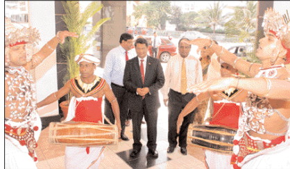
Welcoming the invitees