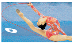
Son Yeon-Jae of South Korea performs during the rhythmic gymnastics individual all-around final during the 16th Asian Games on November 26, 2010. Kazakhstan won the gold medal, Uzbekistan got the silver and South Korea the bronze.