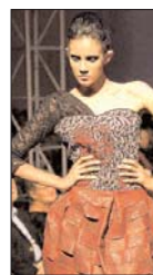
The AOD graduate fashion show