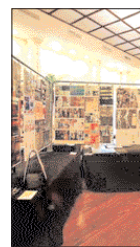
One of the stalls showing the designs of the students