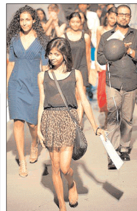
The final walk of the night