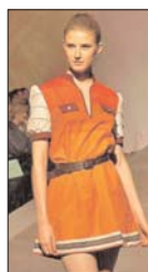
A model showcasing one of the student's designs

The annual AOD Open Day, opens the doors of the campus to the public. AOD is the only institution in Sri Lanka to offer students a globally recognized degree in design.