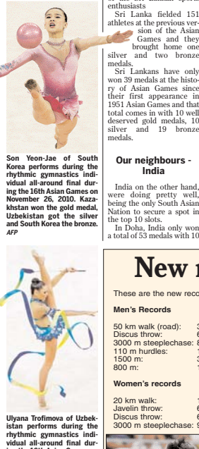
Ulyana Trofimova of Uzbekistan performs during the rhythmic gymnastics individual all-around final during the 16th Asian Games on November 26, 2010. Kazakhstan won the gold medal, Uzbekistan got the silver and South Korea the bronze.