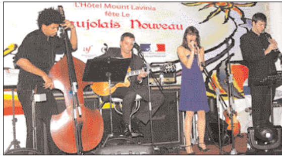
The Lillimarch Jazz quartet sponsored by Qatar