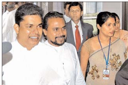
Minister Wimal Weerawansa and Gayantha Karunathilake MP