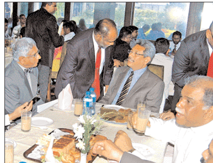
Defence Secretary Gotabhaya Rajapaksa at the tea party