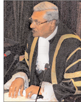
Speaker Chamal Rajapaksa.