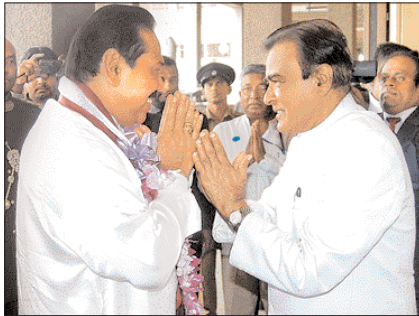
The President being welcomed by Prime Minister D M Jayaratne