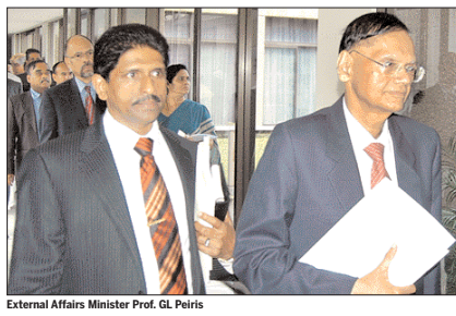
External Affairs Minister Prof. GL Peiris