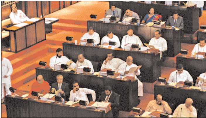
Some of the Ministers