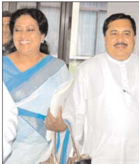
Minister TB Ekanayake and Malani Fonseka, MP