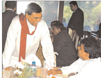
Economic Development Minister Basil Rajapaksa