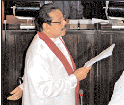
President Mahinda Rajapaksa presenting the budget