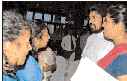
Mass Media and Information Minister Keheliya Rambukwella