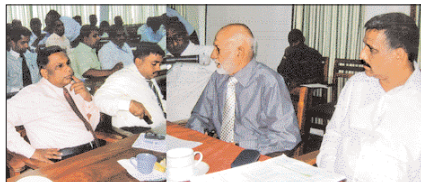
The Ampara District Disaster Management Coordinating Meeting was held at the Ampara District Secretariat recently. Here Disaster Management Minister A H M Fowzie addressing the gathering.