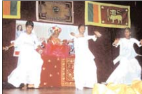
The Nawalappitiya Rena Giraw Welfare Society held its annual certificate and prize-giving ceremony at the Hindu Cultural Centre recently. Five hundred children received prizes, certificates and stationery worth Rs 90,000. Here, a dance performed by the children.