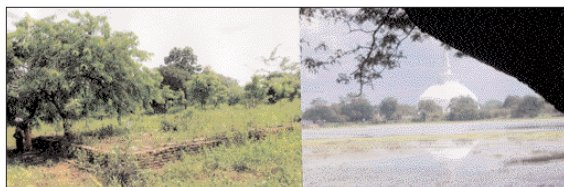
The historic Anuradhapura Mapa Palace is in neglected state. A clan of rulers known as Mapa Clan before King Pandukabhaya is believed to have lived in the area and is on the verge of destruction with lack of attention of the authorities. Ancient artifacts scattered about six acres in the vicinity are also facing the same fate. Left: Ruins of the Mapa Palace at the Northern end of Basawakkulama Tank. Right: Basawakkulama Tank.